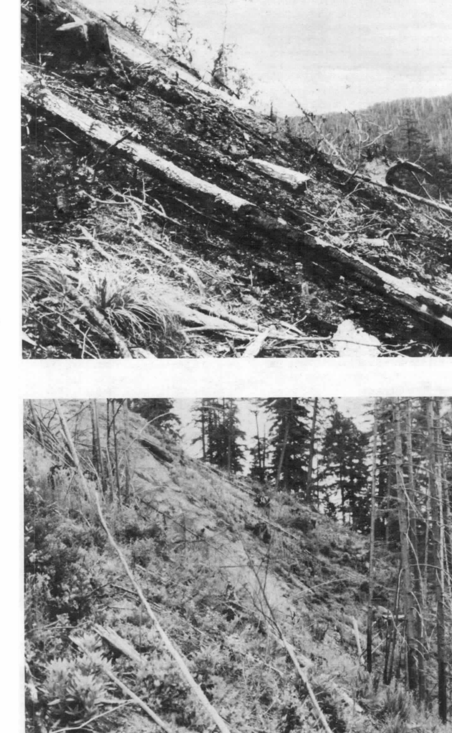
Figure 1.—The southeast slope was largely bare of vegetation in May 1977, 4 months after trees were planted. A clump of beargrass ( Xerophyllum tenax (Pursh) Nutt.) is in the left foreground.