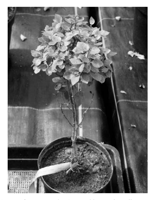
Fig. 3 Dwarf genotype in 4-year-old Populus alba \times Populus tremula hybrid (~0.8 m)

tagenesis is also limited because poplar is dioecious, intolerant to inbreeding, and the transformability of most poplars, especially those outside the aspen group (section Leuce), is insufficient for large scale, genome-wide efforts.