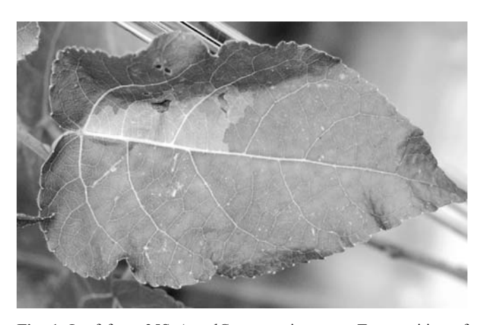
Fig. 1 Leaf from 35S- Ac-rolC transgenic aspen. Transposition of Ac is indicated by the pale green leaf area at top , which is caused by restoration of rolC activity. For details, see Fladung et al. (1997)

Poplar trees grow fast, reaching up to 5 m in a single year, exceeding the greenhouse and space limitations of most research facilities, and rapidly exceeding field site capacities for many research programs (e.g., Fig. 2). Several