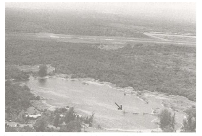
Location of the Lokoaka Pond heronry relative to General Lyman Field in Hilo.

Hawaii- The history of the Lokoaka roost is poorly documented.