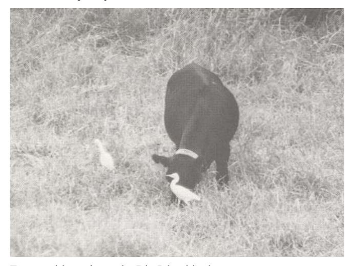
Egrets with cattle on the Big Island in deep grass.

Information reported here only includes data on 22 roosts found in the state; 4 roosts reported from Kauai (Hanamaulu, Kailiilihahinale, Huleia River, and Aepoeha Reservoir) were found after 1984 and not included in these analyses. Roosts throughout the Hawaiian Islands exhibited a number of similarities. Roosts tended to be situated at low elevations, averaging 30 m above sea level (s.d.=76.3), topographically level (85 percent of the total roosts), within 0.5 km of the ocean (80 percent, mean= 1.2, s.d.=1.7), and adjacent to water (95 percent). Seventy percent of the roosts were adjacent to fresh or brackish water. Only one roost, Lumahai, which is a temporary roost, was near afresh water stream; natural or