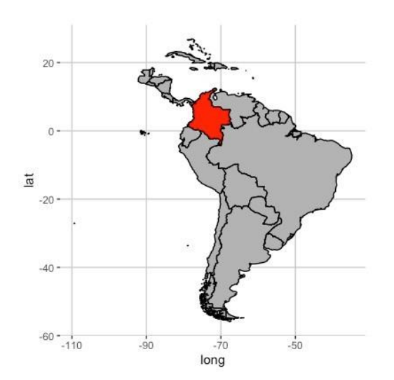
Figure 2. Map of South America, parts of Central America, and the Caribbean, with Colombia highlighted in red, for reference.

Figure 1. Map of the study area used in the Spanish language digital survey comprising northern Bogotá Distrito Capital (D.C.) and the surrounding peri-urban areas.