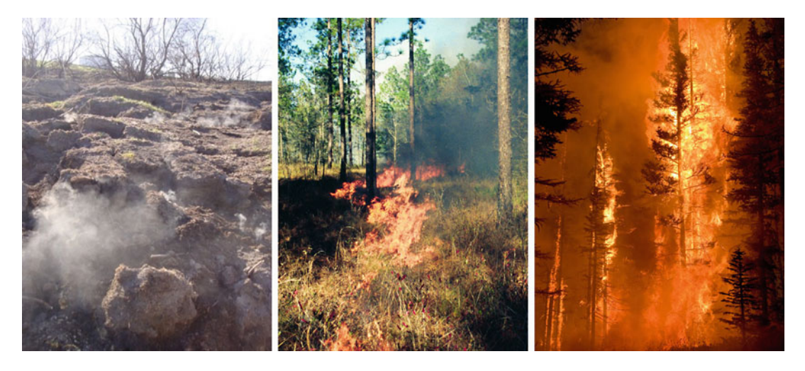
Surface to Crown Transition, Fig. 1 Wildland fire can spread as a ground fire in peat in Tablas de Daimiel, Spain (left), a surface fire in 3-year-old rough under longleaf pine near Tifton, Georgia, USA (middle), or a crown fire on the Okanogan-Wenatchee National Forest, Washing-