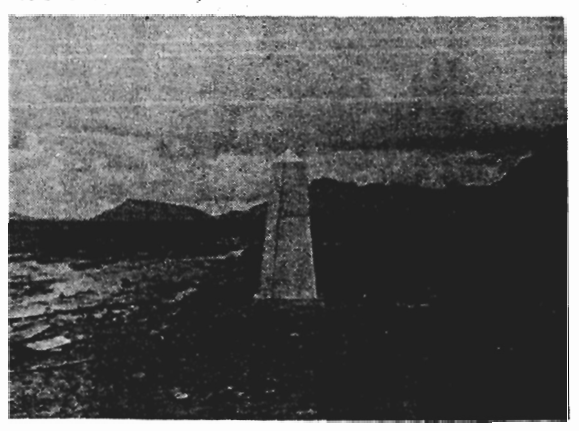
Figure 1.--Monument No. 98 on Mexican border. Located on west bank of San Pedro River. Photo taken 1892. Drainage virtually devoid of any riparian growth. San Pedro River was perennial stream with fish, frogs and turtles.

On the Coronado National Forest, approximimately 20% of the grazing allotments have significant riparian zones. Southern Arizona perhaps is unique in that we probably have more riparian zones today than there were 100 years ago. The increase has been due to overgrazing during the 1890's and early 1900's.