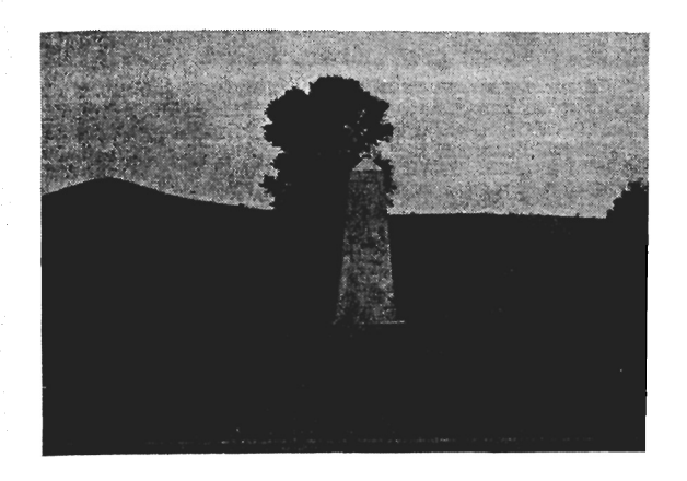
Figure 5.—photo of Monument 118 where Santa Cruz River comes back into U.S. Note limited scattered growth along water course.

in the threatened category, select the key areas. These would be the zones determined to be essential to keep. They may be critical habitat for rare and endangered species. Therefore, reproduction of the tree and shrub species must be ensured.