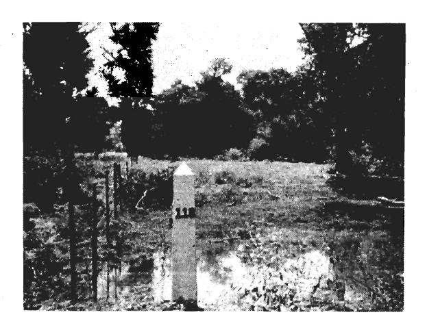
Figure 6.--1969 photo shows a veritable jungle of heavy riparian growth. Original masonry monument washed out in flood in 1914 and replaced with steel monument in 1917.

It has been our experience on the Coronado Forest, that there is no known system of livestock management that will give adequate protection to a riparian zone. Even short term use or seasonal use is inadequate. Because these areas are usually extremely narrow and linear in character, grazing for only a few days can seriously impair its reproductive capability. It's like having the milk cow get in the garden for one night.