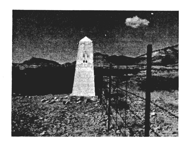
Figure 2.--1969 photo showing dense growth of mesquite. Entire San Pedro River has dense growth of mesquite and other riparian growth.

During this period, there was a continual buildup of cattle to a peak number of 173,000 head by 1900 in the area now encompassing Pima and Santa Cruz Counties. Needless to say, the country was devastated. During the rainy seasons, the runoff resulted in serious flooding causing gullying and heavy soil loss.