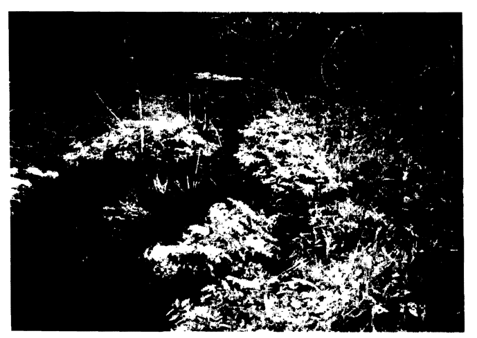
FIGURE 1. Parley's Fork, Red Butte Canyon, Wasatch Mountains, Utah. Stream depth is approx. 0.8 m, exposed width is 0.2 to 0.3 m. Note the lush herbaceous ground cover, overhanging banks, and the vegetation overhanging the stream. Trees and understory are dense. Photograph by R. D. Ohmart, May 1994.

The first indication of a degrading or improving state is usually seen in the condition of the banks. If degrading, they will commonly widen as they erode, changing channel shape from