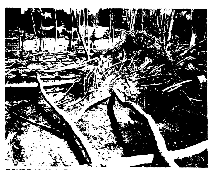
FIGURE 16. Main Diamond Creek, Gila National Forest, New Mexico. Beaver lodge with sticks of dam visible to back left. The animals are living in the water table and consuming mature cottonwoods around them because there are no young trees for food. Photograph by R. D. Ohmart, May 1994.

There is no advantage or benefit to riparian habitats in PFC to be grazed by any large ungulate, be it livestock or elk (Houston 1982, Chadde 1989, Arizona Game and Fish Department 1993). Several years ago when public hearings were held on the transfer of the San Pedro River, Arizona, from private holdings to the BLM, I testified that cattle could be used to economically reduce the fuel load of tall sacaton grasses ( Sporobolus spp.) growing adjacent to and within cottonwood-willow habitats. Removal of this material would prevent fires that are highly detrimental to these forests. Krueper (1993:323), working on the San Pedro River, stated "Grazing within the riparian zone may be used to reduce dense annual growth . . ." to prevent fires. In this very limited situation, cattle may be useful to help reduce fuel loads and prevent wildfires that are especially detrimental to cottonwood trees.