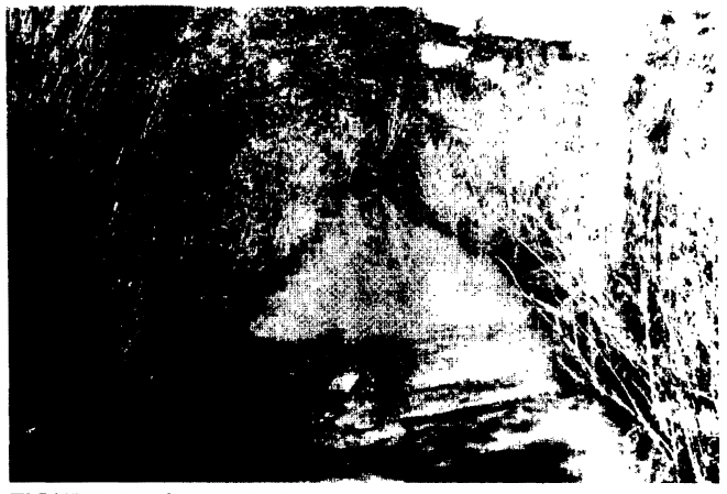
FIGURE 12. Grand Gulch in southeastern Utah that drains the west side of Cedar Mesa and has the same physical characteristics as Road Canyon (Fig. 11). Livestock grazing has been eliminated for 20 years. The dominant woody vegetation along streamside is willow. Some cottonwoods are in the background. Photograph by J. Feller, June 1992.

tuations outside an exclosure were 27C compared to 13C inside the exclosure. Maximum temperatures outside and downstream from the exclosure averaged 11C higher than inside the exclosure. Mean daily water fluctuations were 15C outside the exclosure and 7C inside the exclosure.