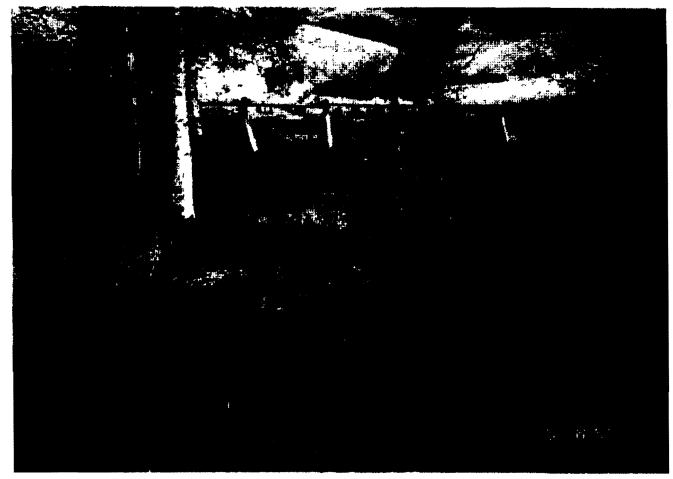
FIGURE 9. Cattle exclosure on small, unnamed stream on the San Felipe Allotment near Challis, Idaho. The only mature aspen on the stream are within the exclosure as are the only young trees (two in background and black stems in the photograph). Photograph by R. D. Ohmart, May 1994.