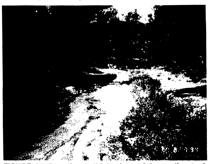
FIGURE 19. Date Creek, Wickenburg, Arizona, livestock managed area with trees lining the primary floodplain. Grasses, sedges, and rushes reestablishing streambanks and beginning to stabilize the sandy soils after the 1993 flood event. Photograph by R. D. Ohmart, June 1994.

Much (approx. 90%) of the floodplain or first terrace of Date Creek was lost in extremely heavy storm events in January and February 1993. A century of January rainfall weather records was broken in 1993, which indicates the magnitude of the event. It should also be kept in mind that the watershed and stream have been degraded for over 100 years and possibly the degradation might have been negligible had they been in good ccological health. The positive side is that management improvements that had accrued over the past 24 years protected the integrity of much of the riparian community. A line of 15-24-year-old willows and cottonwoods had developed along the outer edge of the first terrace and these trees withstood (Fig. 19) and dissipated the erosive force of the flood, keeping most of the scouring in and along the first terrace. In a few places where