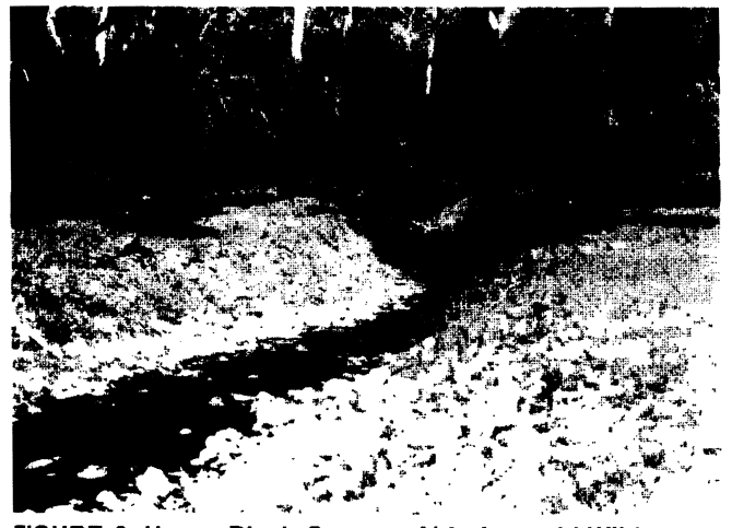
FIGURE 6. Upper Black Canyon, Aldo Leopold Wilderness Area, Gila National Forest, New Mexico. Stream is entrenched at least 1 m, and heavy cobble now forms most banks and the stream channel. Conifers mixed with scattered cottonwoods along the primary floodplain. Photograph by R. D. Ohmart, June 1992.

Collapse of decadent quaking aspen communities in phase III may be of shorter duration than 50 years. There is evidence