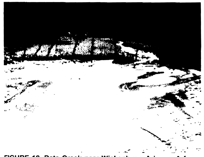
FIGURE 18. Date Creek near Wickenburg, Arizona. A fence separates the unmanaged allotment from the managed downstream area. A major difference in herbaceous groundcover for soil protection and forage availability is obvious in the managed area. Photograph by R. D. Ohmart, June 1992.