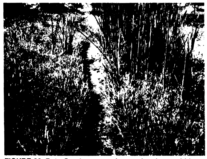
FIGURE 20. Date Creek managed area showing rapid invasion of knot grass ( Paspalum distichum ) and cattail to begin soil stability, sediment trapping, and stream containment. Photograph by R. D. Ohmart, June 1994.