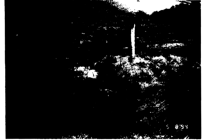
FIGURE 10. Fence line contrast with grass and sedge-covered banks within the exclosure contrasted with raw trampled banks outside. Aspen sapling in background of Figure 9 is that on left side. Photograph by R. D. Ohmart, May 1994.

The continued deterioration of fisheries habitats on western public rangeland from uncontrolled domestic livestock grazing has prompted the American Fisheries Society to publish a position statement (Armour et al. 1994). The paper has been in preparation a number of years and states, "Overgrazing of ripar-