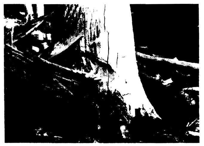
FIGURE 8. Same location as Figure 6. One of numerous mature cottonwoods showing beaver damage. Note collapsed cottonwood forest around the general area. Photograph by R. D. Ohmart, June 1992.

The above is exemplified on a small unnamed stream on the San Felipe Allotment (BLM) near Challis, Idaho, where a 1.5ha cattle exclosure was constructed about 1988. The only remaining aspens or evidence thereof along this stream are in the exclosure (Fig. 9). The contrast between the grass and sedge-stabilized banks in the exclosure (Fig. 10) is striking against the raw, eroding outside banks. Vegetation in the elk exclosure did not differ from that within the cattle exclosure. Elk pellet groups were inside the cattle exclosure and light utilization of willows was evident but there were no raw or trampled streambanks.