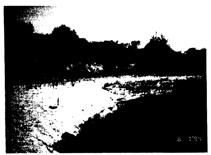
FIGURE 21. Date Creek, before heavy entrenchment this stream once flooded the velvet mesquites on the second terrace to the left of the photograph above the cut bank. Note the absence of rock which would have prevented severe entrenchment. Riparian trees are gone and the sparse understory is dominated by the unpalatable seep-willow ( Baccharis salicifolia).

I know of a few permittees in Arizona that have, on their own, made financial and personal sacrifices to improve riparian habitats on their deeded lands and leased or public lands. I hope there are more in Arizona and throughout the West who are quietly going about their work and doing similarly. These permittees are to be commended and supported for they will be a standard to those who have not made this commitment. As public concern and litigation rapidly increase over the degraded condition of western riparian habitats, the fate of the livestock industry on public lands may rest on these dedicated permittees. They show how natural resources protection and domestic livestock are compatible with proper grazing management. It can be done but it will take more tax dollars and sacrifices on the permittees' part. But, as riparian systems begin functioning properly, the annual harvestable forage for both wildlife and livestock from these flood-irrigated pasturelands will far surpass a decade of forage production from a degraded system.