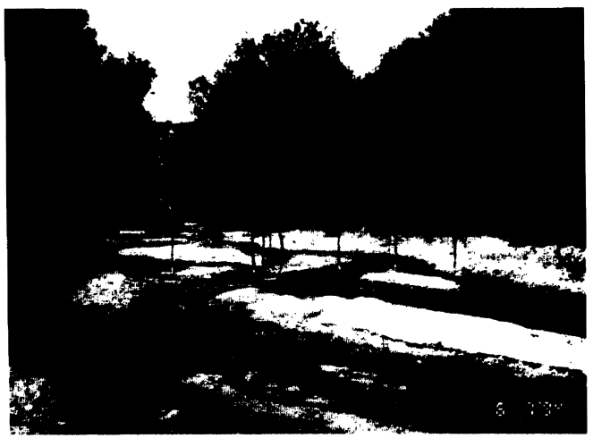
FIGURE 22. Repeat photograph of Figure 18 after an unusually heavy flood event in January-February 1993. The large 4-trunked tree (visible in 1992) in the center is now covered by the small tree to right of the big tree. The line of trees on either side of the primary floodplain kept the erosive waters contained and dispersed erosive energies. Photograph by R. D. Ohmart, June 1994.

Numerous grazing approaches or systems have been developed over the years in an attempt to help deteriorated rangelands and increase forage production. Few, if any of these approaches, consider the condition or grazing impacts on riparian communities (Platts 1981a, 1989). Even the most recent treatise on classifying, inventorying, and monitoring rangeland (National Research Council [NRC] 1994) only devotes about 5 sentences to riparian habitats. Present approaches concentrate on forage removal in the uplands, and by the time that grazing level has been achieved most riparian habitats have been heavily overgrazed. For example, Krueger and Bonham (1986) report that cattle are so attracted to riparian areas in the summer that 90-95% of the adjacent uplands receive little or no use. Meyers (1989) examined 34 grazing systems in Montana and 25 (74%) showed no improvement in riparian areas over 10-20 years, while most showed improvement on the watershed. Clary and Webster (1989) in discussions with managers and after reviewing the literature reported there is not a single grazing management approach that has produced consistent improve-