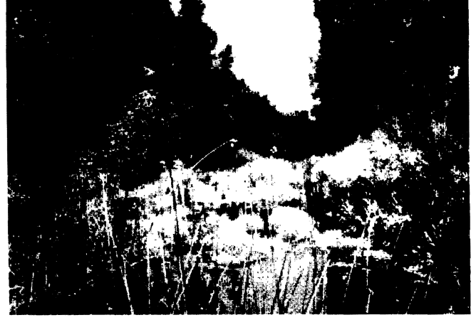
FIGURE 14. (Left) San Pedro River, June 1987. The area is now BLM National Riparian Conservation Area (NRCA) and live stock were removed 1 January 1987. This would be typical of southwestern streams about 1885 with a highly modified channel, trampled banks, no herbaceous groundcover, and understory depauperate. Photograph courtesy of BLM Safford District Office, Arizona. (Right) Repeat of (Left) 4 years (June 1991) after livestock were removed. Photopoint moved to left because developed understory disallowed the photo. Note bank vegetation beginning to narrow and deepen the channel. Photograph courtesy of BLM Safford District Office, Arizona.