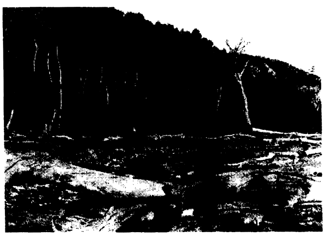
FIGURE 7. Same stream and location as Figure 6. Stream entrenched and banks heavily eroded. The cottonwood forest has begun to collapse. To the back left is a small grove of cottonwoods mixed with conifers. Photograph by R. D. Ohmart, May 1992.

along streams in Idaho that a number of them once supporting willow-aspen mix now only support willows. Once aspens disappear they may or may not pioneer rapidly into the floodplain even with grazing management.