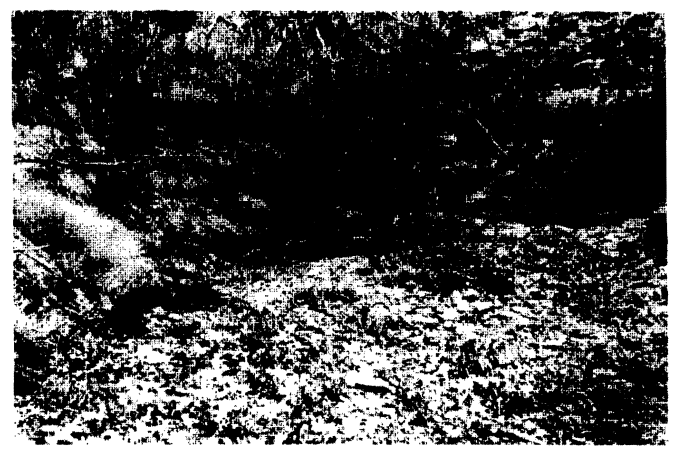
FIGURE 11. Road Canyon in southeastern Utah that drains the east side of Cedar Mesa and has the same physical characteristics as Grand Gulch (Fig. 12). Virtually uncontrolled livestock grazing occurred until December 1993. The stream is entrenched with 2-4 m cut banks with cobble or bedrock bottoms typical along the drainage. Any surface stream flow undercuts banks to further eliminate the remaining riparian trees. No external disturbance occurred except for domestic livestock. Photo by J. Feller, March 1992.