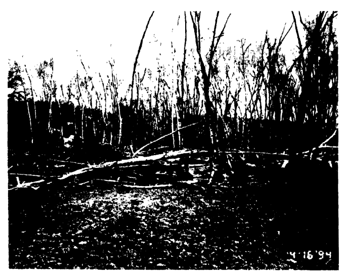
FIGURE 17. Same location as Figure 16. Note extent of tree felling and eventual demise of the cottonwoods. Foreground shows cow pies, tracking, and absence of herbaceous groundcover from unmanaged grazing. Photograph by R. D. Ohmart, May 1994.