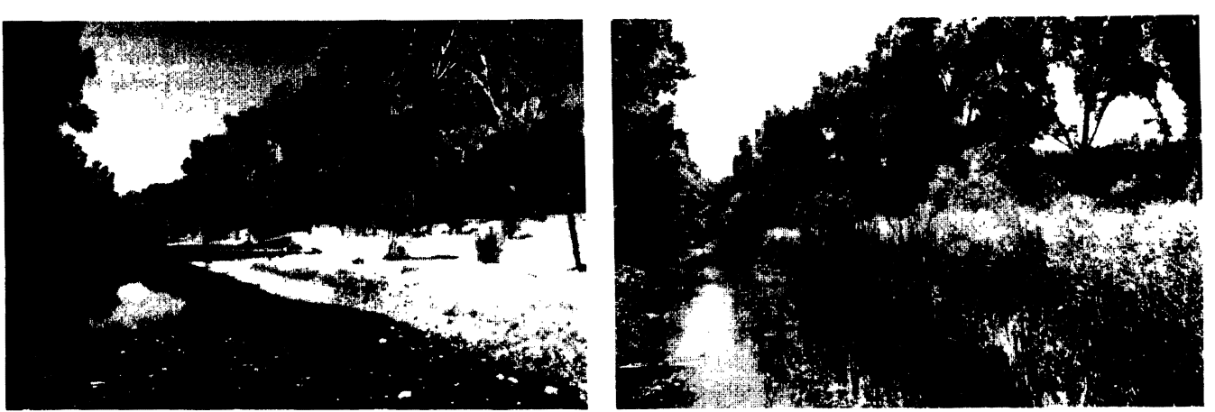
FIGURE 15. (Left) San Pedro River, June 1987. Different location in the National Riparian Conservation Area but stream conditions are typical of unmanaged grazing along stream courses. Photograph courtesy of BLM Safford District Office, Arizona. (Right) Repeat of (Left), June 1991. Stream being narrowed and deepened with encroachment and sediment trapping of the vegetation. Photograph courtesy of BLM Safford District Office, Arizona.

essentially as I described at the end of Phase I. Within 4 years after livestock exclusion, the understory and bank vegetation had increased significantly (Krueper 1993).