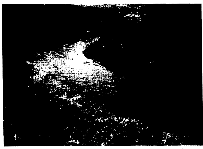
FIGURE 3. Road Creek near Challis, Idaho. Large point bar formed on the Inside stream bend. New materials are being eroded away on the outside bend in high flows. Photograph by R. D. Ohmart, May 1994.

Well-developed or mature sedge communities may approach the soil-holding capacity of a woody-fibrous root mix in resisting erosion. Manning et al. (1989) measured root length density (total root length) in a Carex nebraskensis community on the Sheldon Antelope Refuge in Nevada and found that in 16 cm<sup>3</sup> there were 15 m of root. This root density extended downward for 10 cm before it began to decline, and root depth was measured to 40 cm. The upper roots contained very little soil and these root length densities exceed any measured for any plant community type. This type of root density and depth combined with the tough fleshy leaves overlaying the roots in flood stage creates a formidable barrier to erosion.