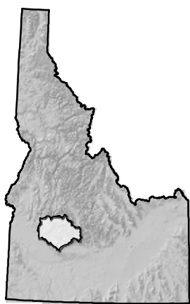
Idaho and Study Area