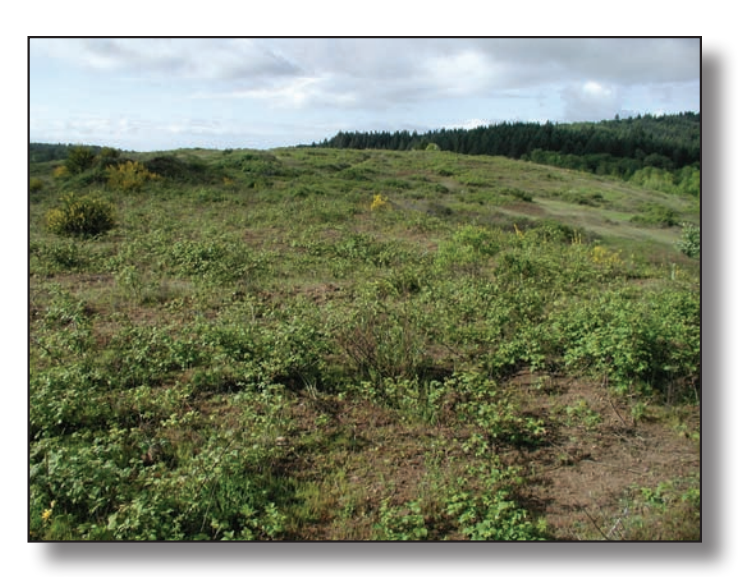
Figure 10-3 —Himalayan blackberry establishing in a disturbed site within the coastal Douglas-fir region.