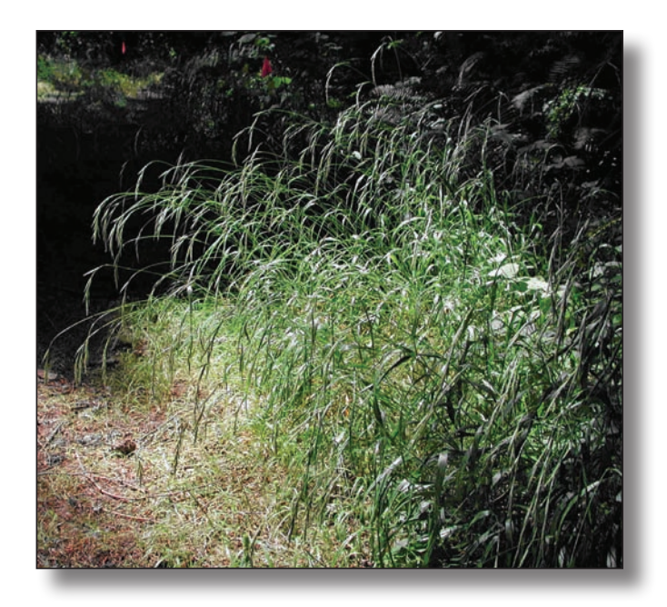
Figure 10-5 —False brome, a nonnative bunchgrass that invades forest understories and roadsides in western Oregon, and forms dense, continuous populations.

currently found in Washington. False brome invades roads, clearcuts, open habitats, and understories of both young and mature undisturbed mixed conifer stands, where it dominates the herbaceous layer and forms dense, continuous populations that exclude most native species (False Brome Working Group 2002, 2004; Kave 2001). Members of the False Brome Working Group have speculated that false brome may alter fire regimes (False Brome Working Group 2002). False brome may increase biomass of fine fuels capable of carrying late-season fires, particularly in well established stands of false brome that have accumulated a heavy build-up of thatch. Alternatively, populations of false brome may decrease understory fire spread of early- and mid-season fires because it has been observed to stay green until late fall (False Brome Working Group 2002). False brome reproduces rapidly from seed but is not rhizomatous (Kave 2001). Observations indicate that false brome is not controlled by burning (False Brome Working Group 2003).