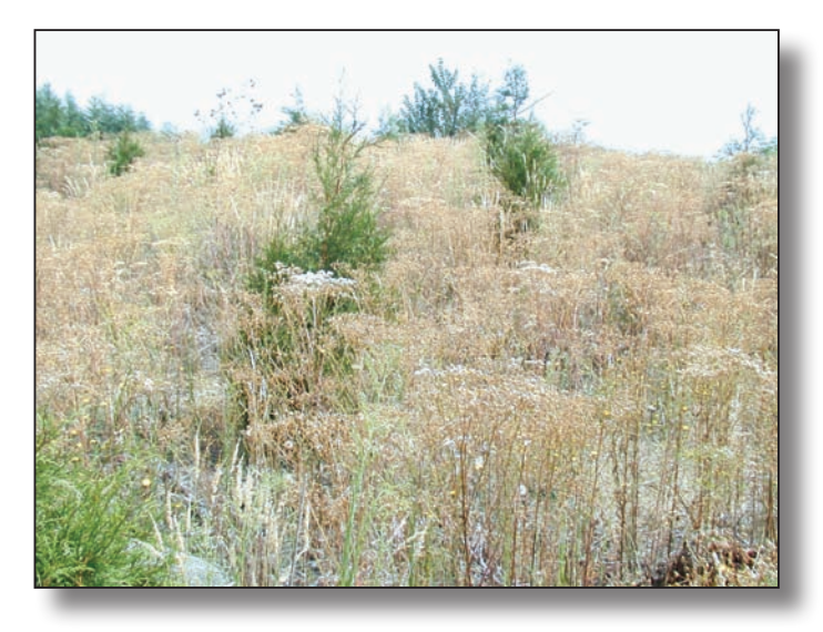
Figure 10-2 —Woodland groundsel dominating a clearcut and broadcast burned site 1 year after disturbance, as is typical for this species in western hemlock forests.

Broadcast-burned clearcuts within western hemlock zone forests of the Cascade Range may also be invaded by nonnative bull and Canada thistles (Cirsium vulgare, C. arvense) (Dyrness 1973; Halpern 1989; Schoonmaker and McKee 1988), St. Johnswort (Hypericum perforatum) (Schoonmaker and McKee 1988), prickly lettuce (Lactuca serriola) and wall-lettuce (Mycelis muralis) (Dyrness 1973; Schoonmaker and McKee 1988). In a study of secondary succession in the western Oregon Cascades, severely burned (surface litter completely consumed) microsites located within broadcast burned harvest units were colonized and dominated by native fireweed ( Chamerion spp.), though nonnative bull thistle (Dyrness 1973) and Canada thistle (Halpern 1989) also established in severely burned as well as lightly burned (surface litter charred but not completely removed) microsites. These two thistle species peaked