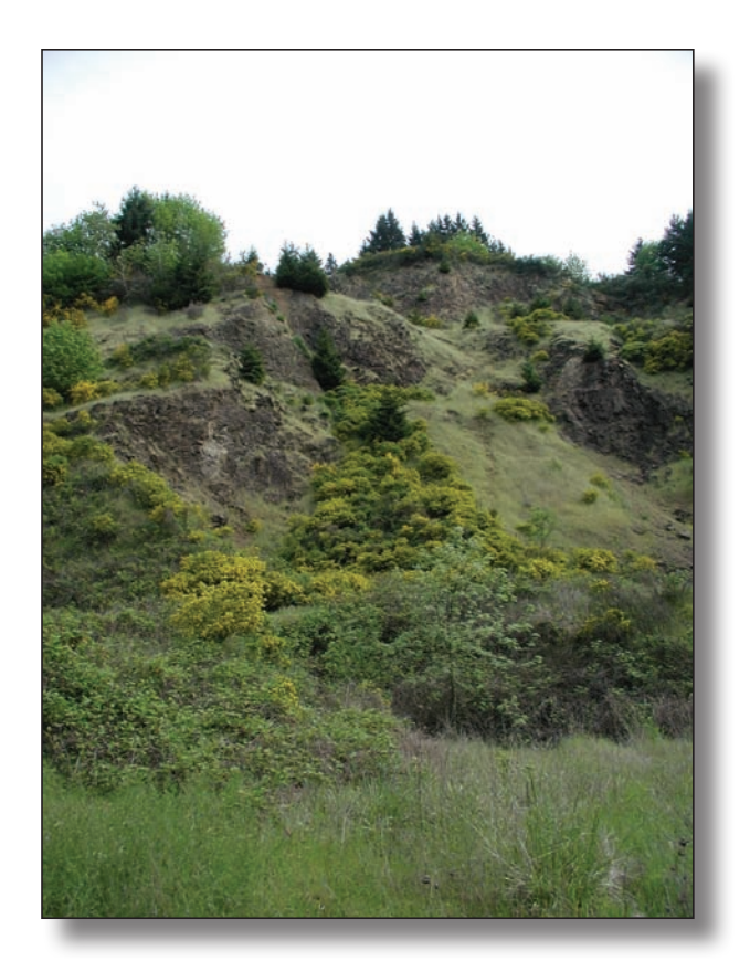
Figure 10-4 —Scotch broom (the shrub with yellow flowers) invades disturbed areas and forms dense populations.

Though it has not been demonstrated that the dominance of either species can increase fire spread or intensity in the coastal Douglas-fir region, the characteristics of both species indicate that such a relationship may exist. In literature reviews, Scotch broom (Hoshovsky 1986; Huckins 2004; Zielke and others 1992) and gorse (Washington State Noxious Weed Control Board 2005; Zielke and others 1992) are described as fire hazards. Early-seral stages of forest succession in coastal Douglas-fir forests are the most flammable (Agee 1997). By slowing reforestation, Scotch broom and gorse prolong these flammable early-seral stand