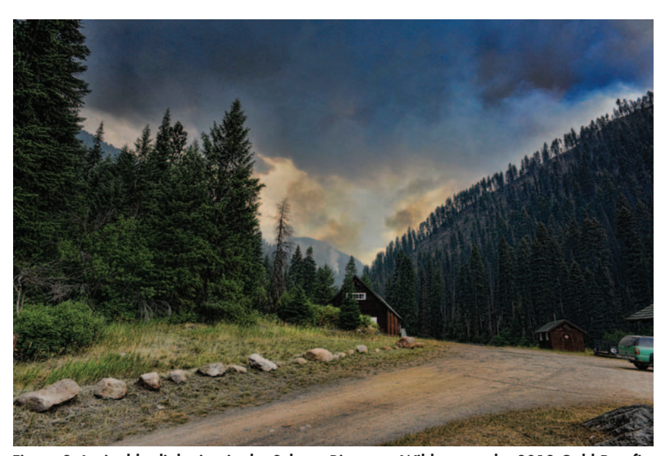
Figure 3. Ignited by lightning in the Selway-Bitterroot Wilderness, the 2013 Gold Pan fire approached the historic Magruder Ranger Station adjacent to the Wilderness. Despite burning under extremely dry conditions and growing to over 40,000 acres, fires from previous years had reduced fuel loads so that the Gold Pan fire did not pose a serious threat to the Ranger Station.

Collectively, the foregoing suggests a need for an expansion of wilderness fire and the science to support decisions to use it. Where wilderness fire has been encouraged, research has demonstrated desirable results. Fuel loads are lower, fire behavior is moder-