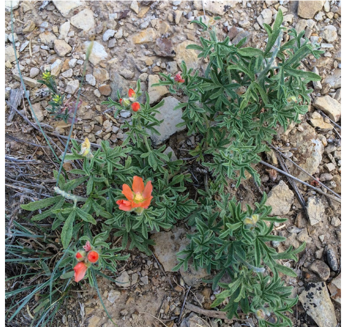
Figure 2. Scarlet globemallow growing in gravelly soil in Wyoming.

staminal column is 3 to 5 mm long (Holmgren et al. 2005). Fruits are segmented schizocarps (4.8-6.7 mm in diameter) (Fig. 3), which split into 8 to 14 mericarp sections (Welsh et al. 1987; Holmgren et al. 2005; La Duke 2016). The schizocarps and their mericarps have stellate pubescence, similar to that of the stems and leaves (Craighead et al. 1963). Mericarps are prominently veiny and contain one kidney shaped, brown to black seed (Stubbendieck et al. 1986; Holmgren et al. 2005; La Duke 2016).