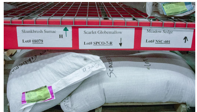
Figure 9. Scarlet globemallow seed being stored at the Utah Division of Wildlife Resources' Great Basin Research Center until use in wildland restoration.

Seeding and planting methods have been used to revegetate or restore wildland sites with scarlet globemallow.