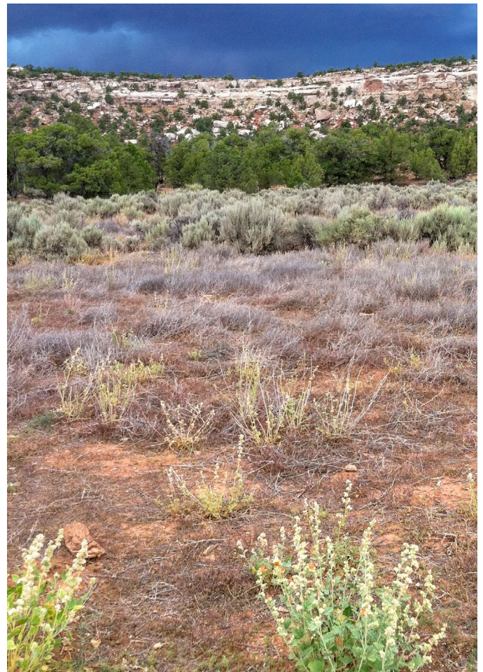
Figure 6. Scarlet globemallow with ripe schizocarps.

Wildland Seed Collection. Scarlet globemallow is one of the earliest flowering globemallows (La Duke 2016). Indeterminate flowering and seed production mean collections may be made at a single site for weeks (Hewitt 1980) and across sites for months (USDI BLM SOS 2017). Seed is released once schizocarps are fully mature, so careful monitoring once plants begin to flower is needed to maximize wildland seed collections (Fig. 6) (Shock et al. 2015). In 1997, between 50 and 1,000 lbs (20-450 kg) pure live seed (PLS) of wild-collected scarlet globemallow seed was available (McArthur and Young 1999).