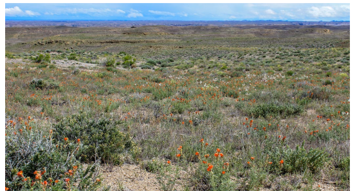
Figure 1. Scarlet globemallow growing in typical shrubland/grassland habitat in Utah.

Throughout its range, scarlet globemallow is also common in a variety of shrublands (Fig. 1) and woodlands. In the Intermountain West, scarlet globemallow occurs with greasewood ( Sarcobatus spp.), saltbush ( Atriplex spp.), sagebrush ( Artemisia spp.), pinyon-juniper ( Pinus-Juniperus spp.), and Gambel oak ( Quercus gambelii ) (Holmgren et al. 2005). In western Montana, it is common with bluebunch wheatgrass, western wheatgrass, and skunkbush sumac ( Rhus trilobata ) and often increases in abundance with grazing (Mueggler and Stewart 1980). It is also a noted forb in ponderosa pine ( Pinus ponderosa )/bluebunch wheatgrass woodlands in the Little Belt Mountain foothills in Meagher County, Montana (Daubenmire 1952). In a survey of grasslands and shrublands in Wyoming and Colorado, it was important in abandoned agricultural lands, blue grama short-grass prairies, dry meadows occupying alkaline swales near streambanks, mixed grass-sedge, big sagebrush ( Artemisia tridentata ), pinyon-juniper, and browse shrubland types dominated by Gambel oak and alderleaf mountain mahogany ( Cercocarpus montanus ) (Costello 1944b). In Utah, blackbrush ( Coleogyne ramosissima ), salt desert brush, mixed desert shrub, pinyon-juniper, and ponderosa pine vegetation types are common scarlet globemallow habitat (Welsh et al. 1987).