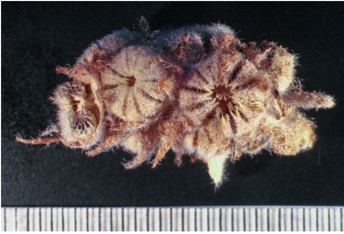
Figure 3. Scarlet globemallow schizocarps. Scale in mm.

Belowground. Scarlet globemallow produces slender, deep taproots with limited branching and lateral development. Water is likely absorbed along the entire length of the taproot because it is fleshy and shrinks rapidly with exposure to air (Weaver 1958). When eight plants were excavated from three prairies in southwestern Saskatchewan, roots were 2 to 5 mm in diameter at the soil surface and tapered to 1 mm at 35 to 47-inch (90-120 cm) depths. The maximum rooting depth was 5.9 feet (1.8 m) (Coupland and Johnson 1965). In short-grass prairie in west-central Kansas, scarlet globemallow roots were slender and unbranched until about 3 feet (1 m) deep where they divided into laterals spanning about 1-foot (0.3 m). Taproots reached 7.5 feet (2.3 m) deep (Albertson 1937).