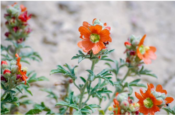
Figure 4. Scarlet globemallow inflorescences and flowers.

Diadasia species, are important pollinators (Pendery and Rumbaugh 1993). In greenhouse experiments, scarlet globemallow produced few schizocarps and little seed when self-pollinated. When outcrossed, flowers produced 8 to 10 times as many schizocarps and 5 to 9 times as much seed as protected flowers. Indeterminate flowering and a broad elevational and geographical range suggest that scarlet globemallow supports a diversity of pollinators. In wild populations, a diversity of bees visit scarlet globemallow flowers. Two sunflower bee ( Diadasia spp.) specialists occurred in every globemallow patch visited in Nevada, eastern Oregon, southern Idaho, and northwestern Utah (Cane 2009). Scarlet globemallow flower nectar is also a food source for mature small-checked skipper butterflies ( Pyrgus scriptura ) (LBJWC 2018).