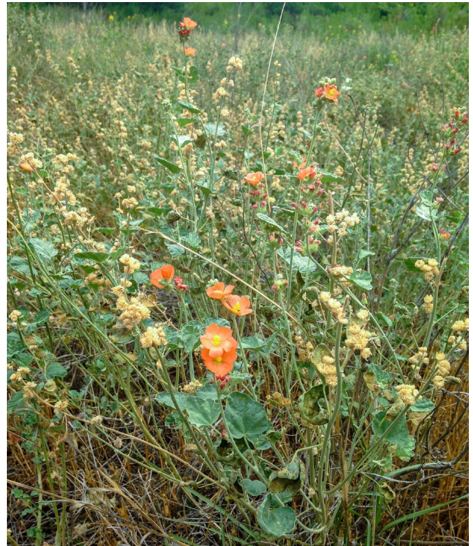
Figure 7. Scarlet globemallow with open schizocarps shedding or having already shed seed.

Of 37 total seed harvests made by BLM SOS crews, 22 (or about 60%) were made in July (Fig. 7). Collections spanned 12 years and elevations of 4,000 to 7,700 feet (1,200-2,300 m) in Colorado, Wyoming, and Utah. The earliest collection was made on June 5, 2016 from 4,867 feet (1,483 m) in Mesa County, Colorado. The latest collection date was August 18, 2009 from 4,722 feet (1,439 m) in Big Horn County, Wyoming (USDI BLM SOS 2017). Seed maturity is also common in August throughout the range of the species (Belcher 1985). For scarlet globemallow plants growing in exclosures in sagebrush-short grass vegetation in northern Colorado, fruit development and seed shatter occurred in August during 2 years of observations (Menke and Trlica 1981).