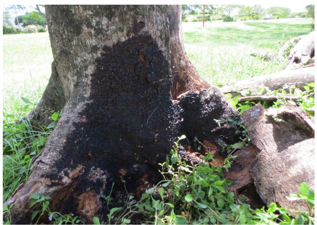
Figure 1: Dried mycelial mat of Pyrrhoderma noxium on a moso'oi (Cananga odorata) tree in American Samoa.