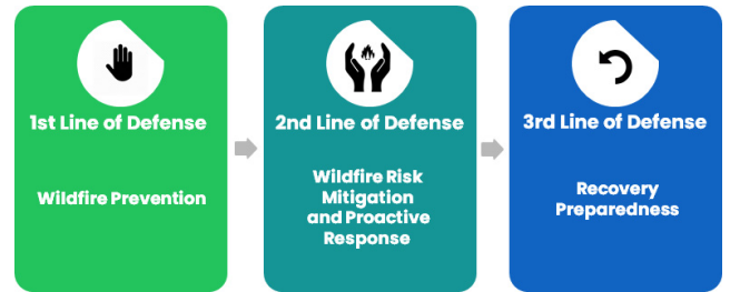
FIGURE 2. Three lines of defense framework for wildfire risk management in electric power infrastructure.

With that background, we define a three lines of defense framework for managing the risk of wildfires in electric power infrastructure, as follows. The first line of defense focuses on strategies to prevent wildfires from occurring in the first place. Recognizing that the first line of defense may not always hold, the second line of defense is focused on mitigation strategies and proactive response to minimize hazardous impacts of wildfires on the power system and its surrounding natural and built environment, should a wildfire spark. Finally, if a wildfire sparks and spreads despite all the defensive measures in the first two lines, we need a third line of defense that is focused on resilience-building measures and recovery preparedness so the system can bounce back to its pre-wildfire condition as quickly as possible without suffering devastating losses. Each of these lines plays a distinct role within the utility’s wildfire risk governance structure. Figure 2 illustrates the proposed framework and its three lines of defense. Table 1 shows the components of each of these three lines of defense and the articles which have been reviewed in each of these subject areas. As shown, the first line of defense includes prediction of the wildfires, timely detection of the fire-inducing faults in the grid, early detection of the wildfires, effective asset