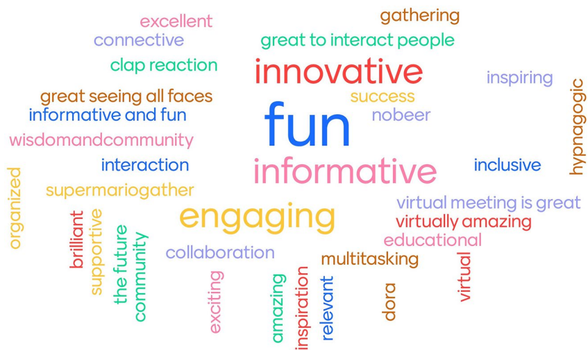
Figure 2. The most common word used to describe the AmeriFlux 2020 meeting in a post-meeting survey was the word “fun.” This word cloud was produced in real time from a quick questionnaire completed by participants on mentimeter.com.

Post-battle/meeting feedback was overwhelmingly positive, with participants commenting that it was among the best virtual meetings they had attended, and 100% of survey respondents ( n = 59 ) stating that they would attend again. There was consistent appreciation for all the elements of the meeting—talks, posters, breakouts, mixers, and social events. Coming out of quarantine in the future, the success of some of these virtual meeting elements is strong support, yet also raises questions, for subsequent meetings.