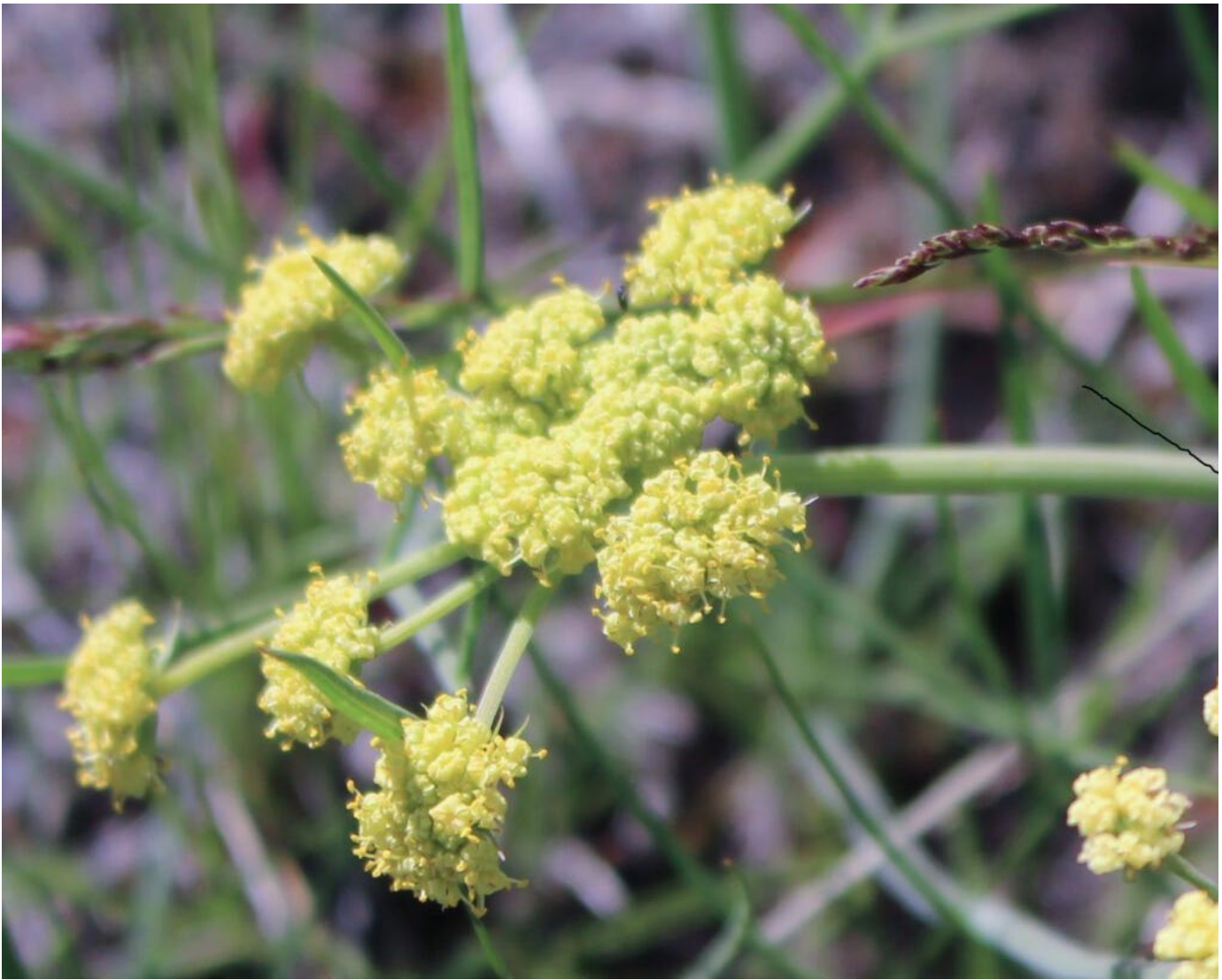
Figure 6. Nineleaf biscuitroot's compound umbel with the typical unequal ray lengths and umbellets in full bloom.

Varieties. Nineleaf biscuitroot varieties in some locations are poorly defined (Hickman 1993) and in other locations are in taxonomic flux (Lesica and Kittelson 2013; Sosa et al. 2015). In California, variety macrocarpum is a stout plant that produces 0.3 to 0.8-in (8-20 mm) long fruits and occurs at 660 to 5,000 ft (200–1,500 m) elevation (Munz and Keck 1973; Hickman 1993).