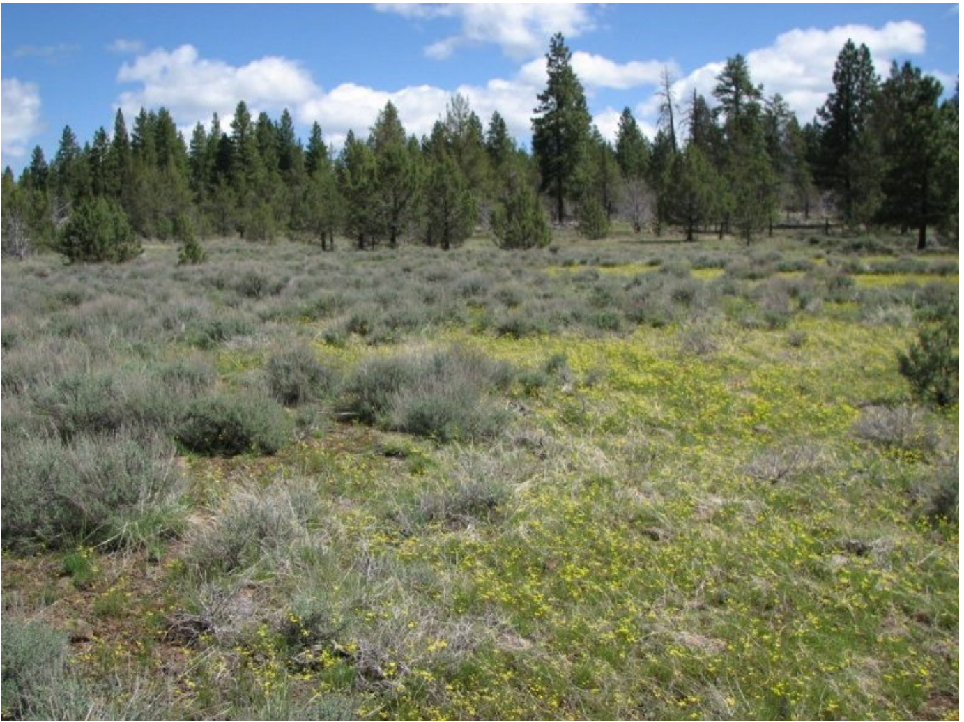
Figure 3. Nineleaf biscuitroot growing in an upper elevation sagebrush community abutting a montane forest in Oregon.