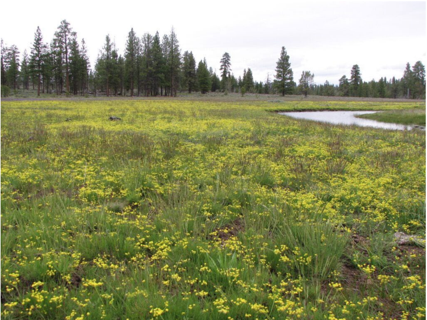
Figure 2. Nineleaf biscuitroot growing in a montane forest opening in Oregon.

Shrublands. Sagebrush shrublands are common habitat for nineleaf biscuitroot (Fig. 3). In Oregon and Idaho, nineleaf biscuitroot occurred in low sagebrush, mountain big sagebrush, threetip sagebrush, and antelope bitterbrush shrublands (Tisdale et al. 1965; Dealy and Geist 1978; Doescher et al. 1986; Huntly et al. 2011). On Silver Lake winter range in south-central Oregon, nineleaf biscuitroot was a prominent forb in low sagebrush at 5,200 ft (1,585 m) where annual precipitation averaged 15 in (380 mm) (Dealy and Geist 1978). Nineleaf biscuitroot was a principal forb in threetip sagebrush/Idaho fescue ( Festuca idahoensis ) vegetation on north and east slopes and in threetip sagebrush/Idaho fescue/bluebunch wheatgrass vegetation on south and west slopes at Craters of the Moon National Monument, Idaho. The threetip sagebrush community occupied moister, cooler sites with relatively deep, fertile soils (Tisdale et al. 1965).