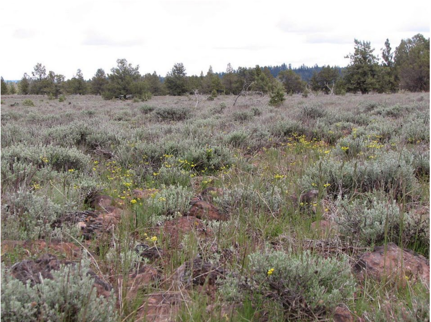
Figure 1. Nineleaf biscuitroot growing in a dry sagebrush community in Oregon.

Nineleaf biscuitroot is adapted to intense sun exposure (Fig. 1). Plants have leaves with very narrow blades that resist water loss with excessive radiation. It is common in open terrain, rocky sites, meadows, and mountain sites with high sun exposure (Daubenmire 1975a). Nineleaf biscuitroot occurs in dry to moist plains, foothills, lower and mid-montane locations, and is occasional at high-elevation sites averaging 90 or more frost-free days (USDA FS 1937; Lambert 2005a; Tilley et al. 2010; Pavék et al. 2012). It occurs at sites receiving 8 to 20 in (203–508 mm) of annual precipitation that are typically moist in spring but dry by early summer (Taylor 1992; Skinner 2007).