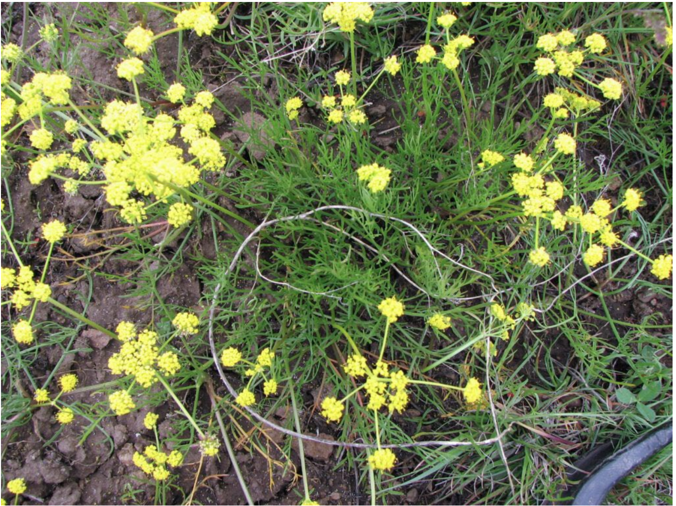
Figure 5. Nineleaf biscuitroot plant with highly dissected leaves and umbellets with small yellow flowers in compound umbels.