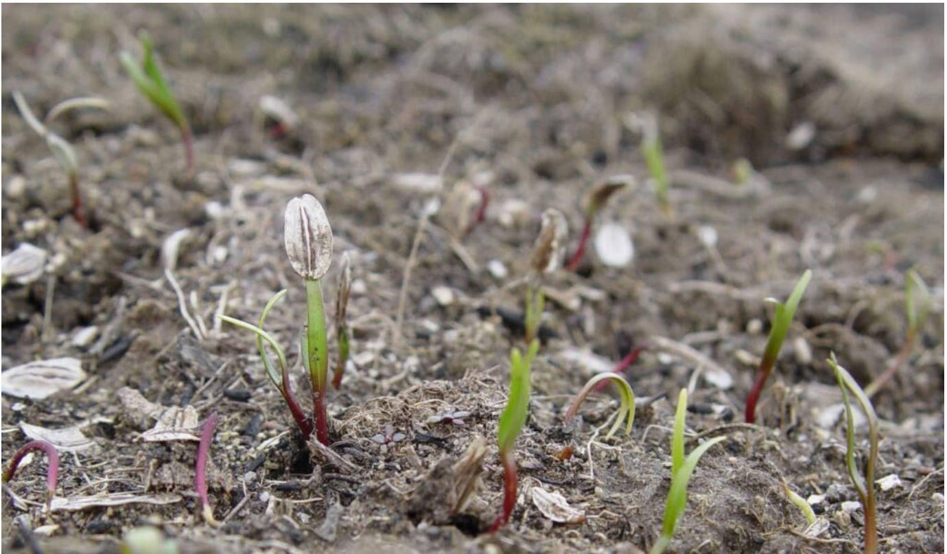
Figure 12. Nineleaf biscuitroot seedlings emerging from a southern Idaho planting.

Table 6. Timing of flowering and seed harvest dates for nineleaf biscuitroot seed production fields over a period of 9 years at Oregon State University's Malheur Experiment Station, Ontario, OR (Shock et al. 2016). Seed yields are provided in Table 7 (Shock et al. 2016, 2018).