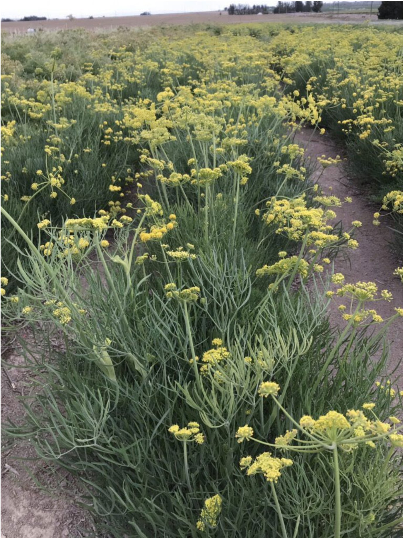
Figure 13. Nineleaf biscuitroot irrigation trial at OSU MES.