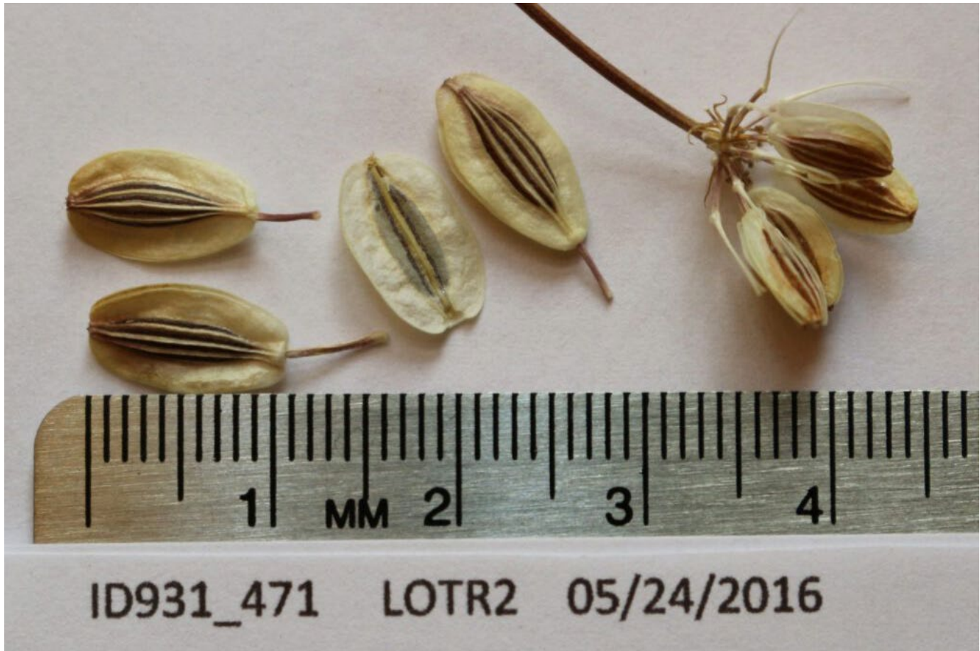
Figure 11. Nineleaf biscuitroot fruits (winged schizocarps with ribs) and a mericarp (center) with the commissure visible.

Seed can be cleaned to high purity with minimal air screening (Ogle et al. 2012). Seeds must be handled carefully as they are fragile and brittle. Small collections can be carefully hand-rubbed to free seeds from the inflorescence then cleaned using an air column separator. Large collections require cleaning with air screen equipment (Skinner 2007).