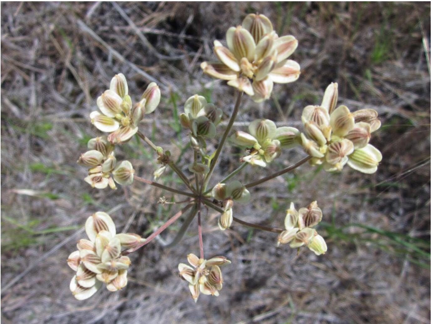
Figure 7. A single nineleaf biscuitroot compound umbel with mature fruits (schizocarps).