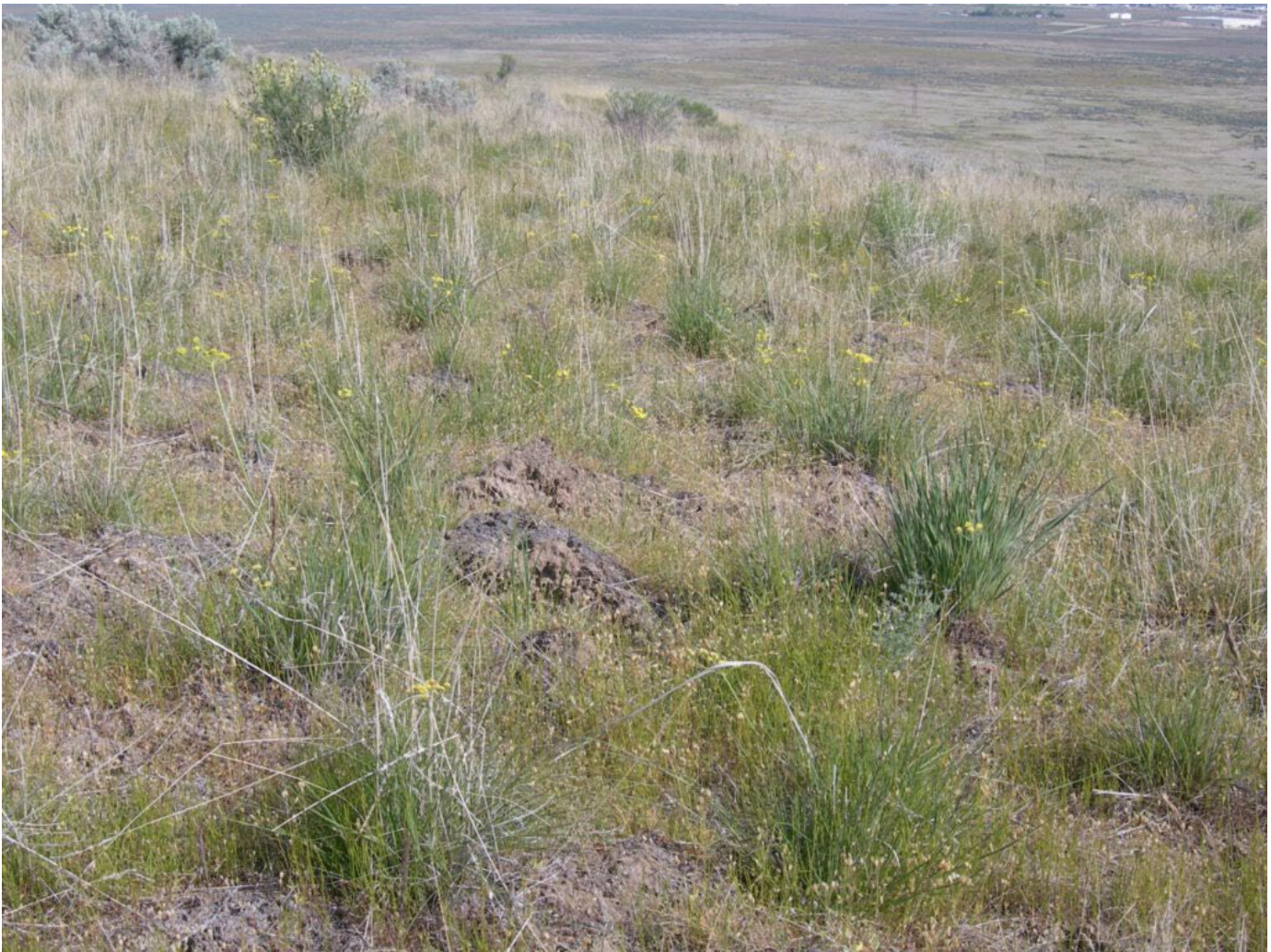
Figure 4. Nineleaf biscuitroot growing with bluebunch wheatgrass near Boise, ID.