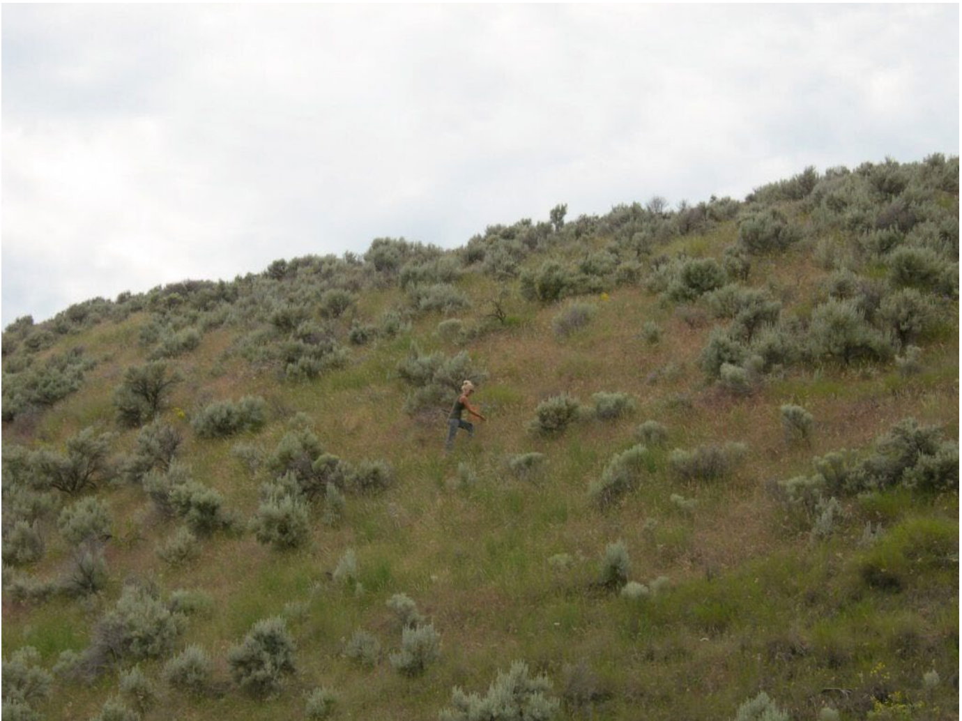
Figure 10. Collecting wildland nineleaf biscuitroot seed in a sagebrush community.

Several collection guidelines and methods should be followed to maximize the genetic diversity of wildland collections: 1) collect seed from a minimum of 50 randomly selected plants; 2) collect from widely separated individuals throughout a population without favoring the most robust or avoiding small stature plants; and 3) collect from all microsites including habitat edges (Basey et al. 2015). General collecting recommendations and guidelines are provided in online manuals (e.g., ENSCONET 2009; USDI BLM SOS 2021).