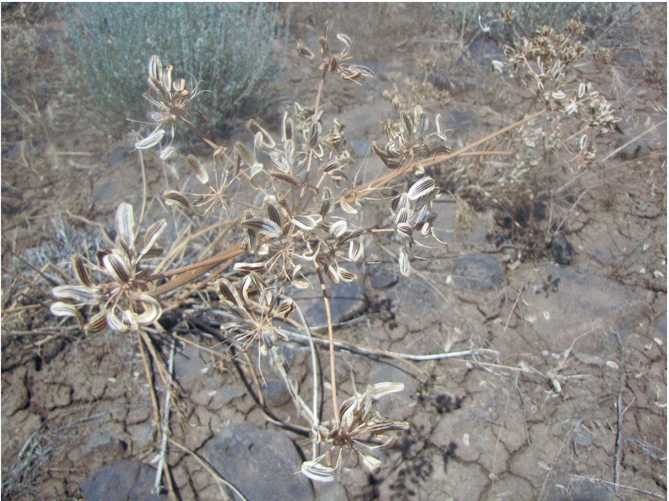
Figure 9. Nineleaf biscuitroot with mature seed dispersing.