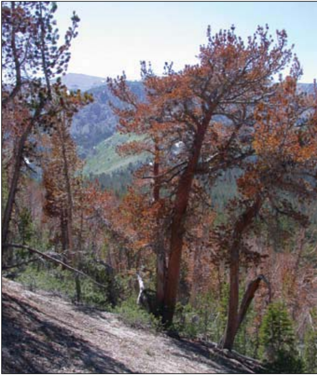
Subalpine forest mortality in the Sierra Nevada of California – one of the “surprises” of climate change that must now be anticipated (whitebark pine, Pinus albicaulis )

productivity where water and nitrogen are not limiting factors, ozone and other industrial pollutants in combination with increasing climate stress are likely to decrease tree growth and severely affect watershed condition.