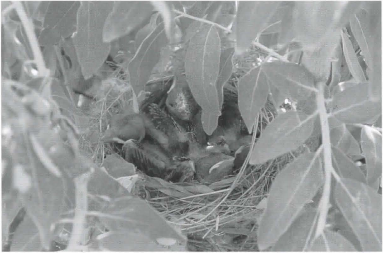
Figure 2. Nest of the Blue Grosbeak in a Russian olive along the middle Rio Grande, New Mexico.