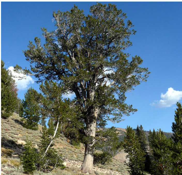
Whitebark pine forests are declining across most of their range in North America because of the combined effects of insect and disease mortality and fire exclusion. Guidelines for restoring whitebark pine under future climates are presented in a recently published GTR (RMRS-GTR-361).