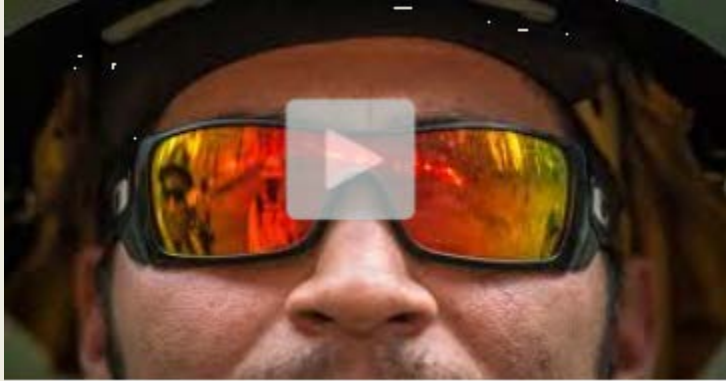
Heart of a Firefighter

These videos are examples of the many that exist that can help families understand the job of wildland firefighting. In addition to websites, many agencies also have their own YouTube channels, Flickr sites, and other social media sites where more examples can be found. The National Interagency Fire Center (NIFC) website, https://www.nifc.gov/ , also has a wealth of information.