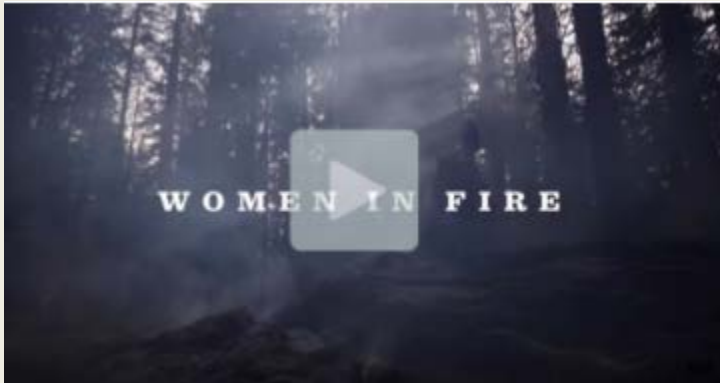
Women in Fire