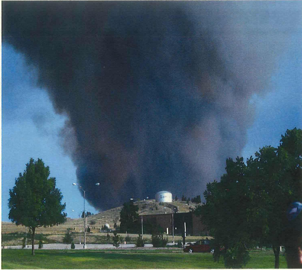
Figure 1: Fire burning into Chadron, NE in 2006

These fires tend to threaten our communities: