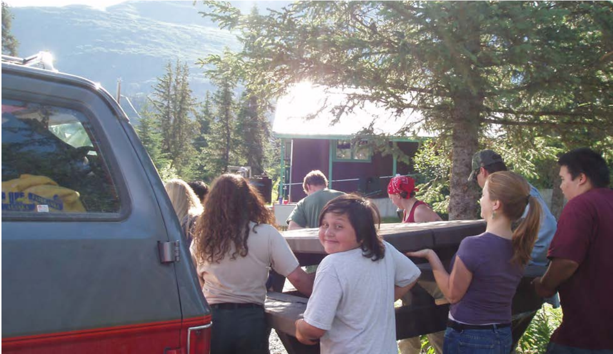
Kenaitze Indian youth and Chugach National Forest employees at Kenai Lake Work Center, Alaska.

W orking with Tribes helps the Forest Service fulfill our mission of “providing leadership in the management, protection, use, research, and stewardship of natural and cultural resources on our country’s vast forests and grasslands.” This work also encompasses the extensive legal requirements through treaty obligations and trust responsibilities that establish the foundations for this work and our relationships with Tribes. This work allows the Forest Service and Tribes to better “sustain the health, diversity, and productivity of the Nation’s forests and grasslands to meet the needs of present and future generations.”