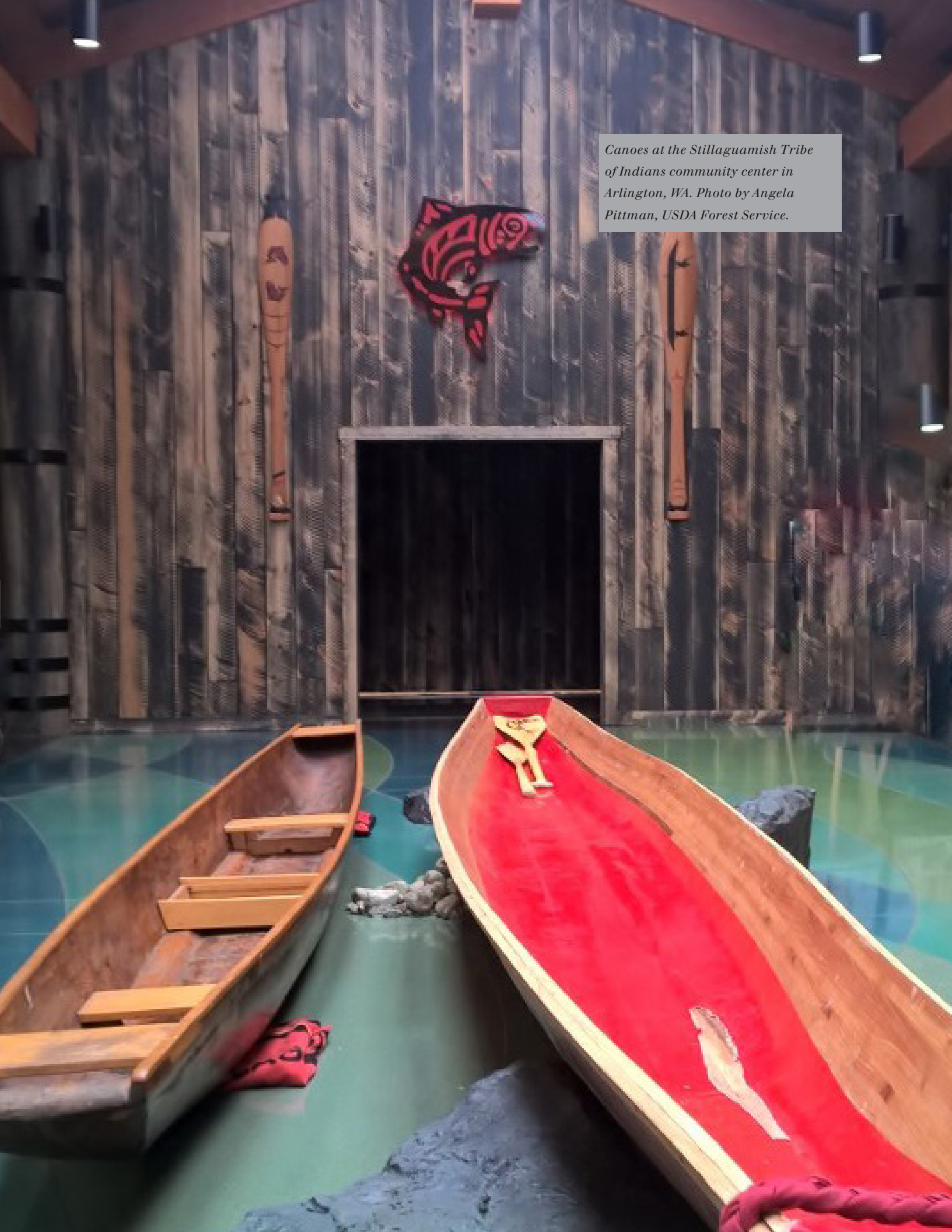
Canoes at the Stillaguamish Tribe of Indians community center in Arlington, WA.