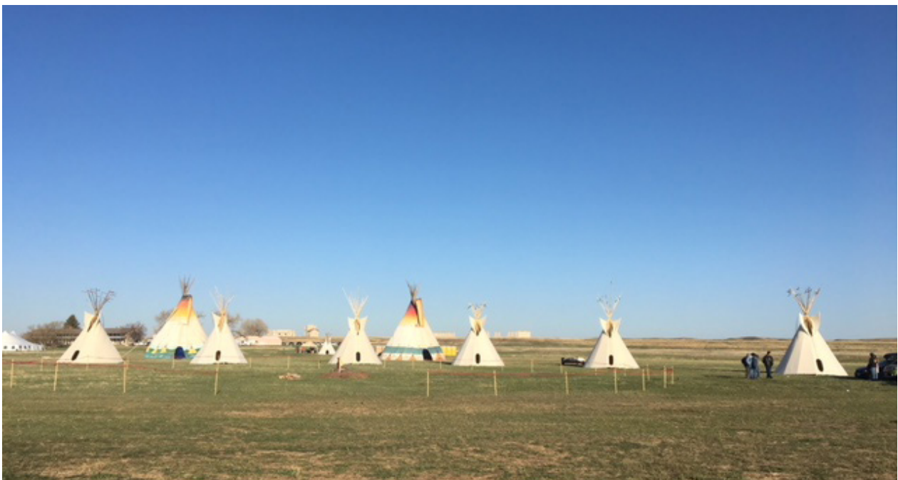
Recognition of the signing of the 1868 Fort Laramie Treaty Event, Fort Laramie, WY, on April 28, 2018.

complement each other. The Forest Service engages with governments of Tribal Nations in ways that produce mutual benefits. These benefits assist Tribes in accessing goods, services, and opportunities provided by forest cultural and natural resources important to Native American communities and individuals. Aside from resource opportunities on the land, Forest Service personnel conduct outreach to advance American Indians and Alaska Natives in the workforce, engage youth and elders for cultural preservation, and promote many other activities. Many of these activities may originate