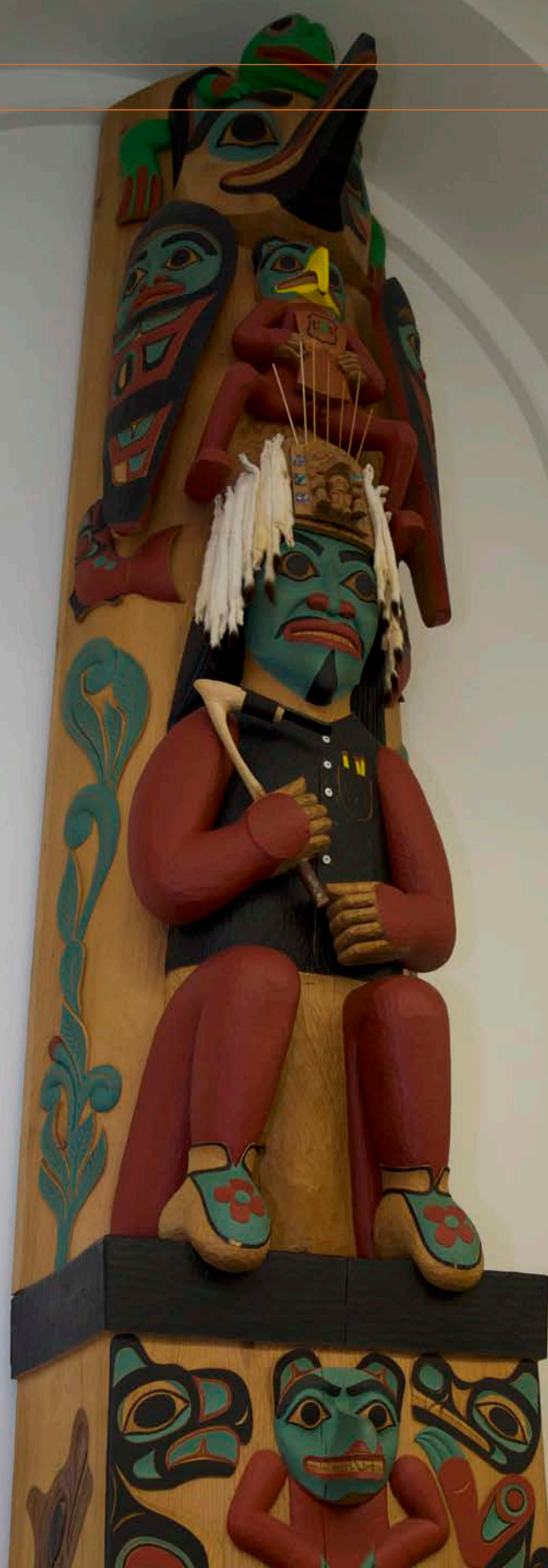
A totem carved by Tlingit master carver Israel Shotridge located in a hall of the USDA Forest Service, Sidney R. Yates Federal Building, Washington DC.