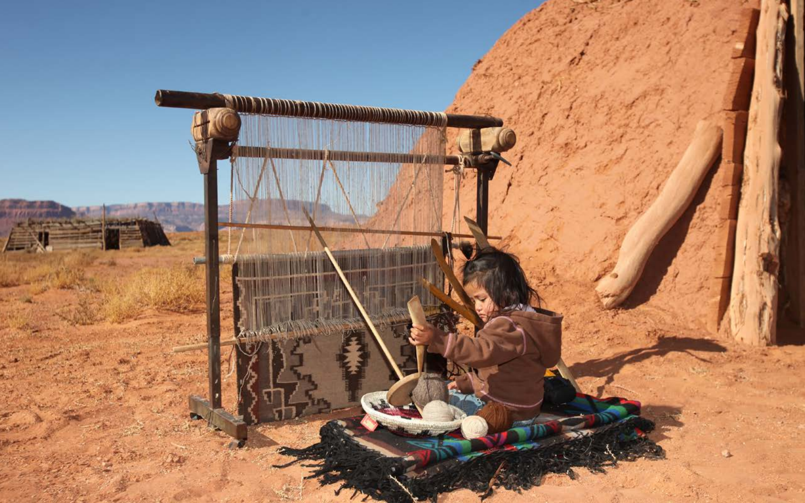
A young Native American girl using a loom to weave a traditional blanket.

The relationship between the Federal Government and Tribal Governments is unique and important. It is important to the Forest Service because Tribes have indelible ties to the Nation's forests and grasslands. Those ties not only reach to the millennia of the past but also include current knowledge, perspectives, and resources that will help the Forest Service as we focus on the future of our mission.