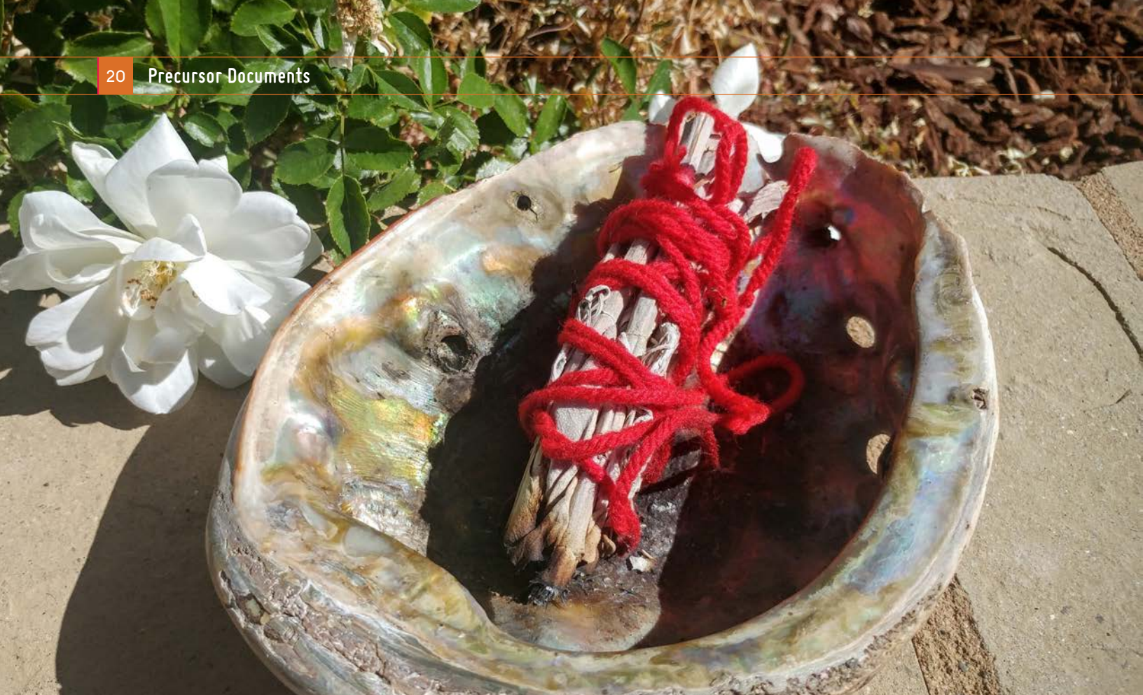
Sage in abalone used in traditional tribal ceremonies.