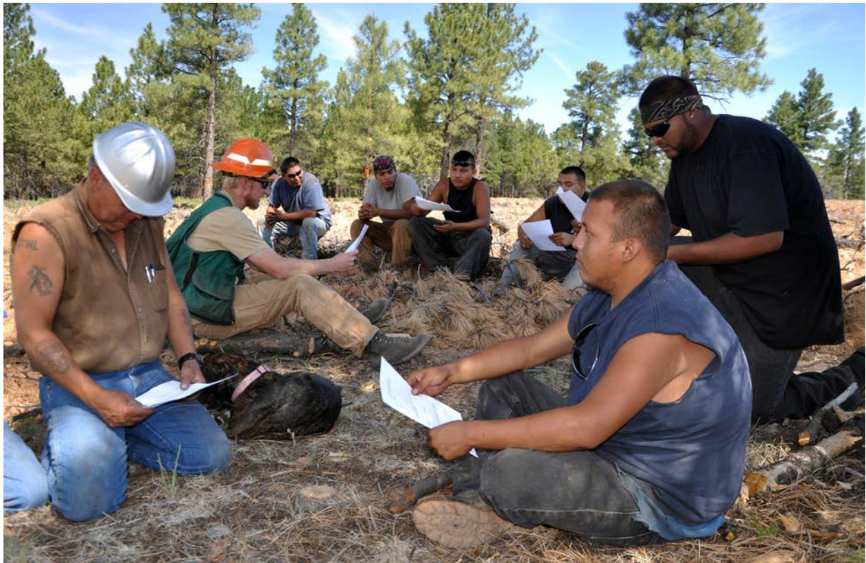
The Kaibab National Forest in Arizona and Alamo Navajo School Board Inc. (ANSBI) began a new partnership to conduct restoration work on the forest, while providing employment and training for Navajo tribal members.

The Forest Service recognizes and supports the sovereignty of American Indian and Alaska Native tribal nations and the self-determination of tribal peoples through building, maintaining, and enhancing government-to-government relationships with Tribal Governments. We engage inclusively with people in mutual respect, active collaboration, and shared stewardship. We promote meaningful nation-to-nation consultation with tribal nations and communities in ways that foster free, prior, and informed consent.