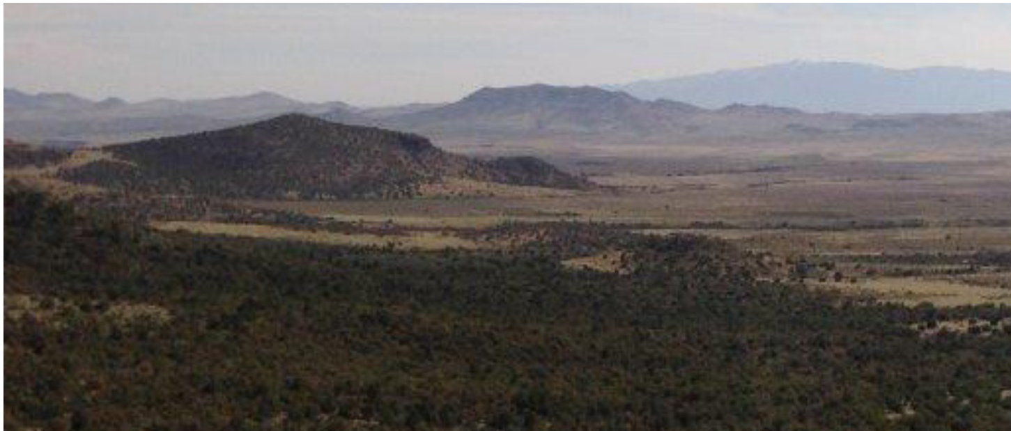
View of Mount Graham, a sacred place, from the San Carlos Apache Indian Reservation in southeastern Arizona.