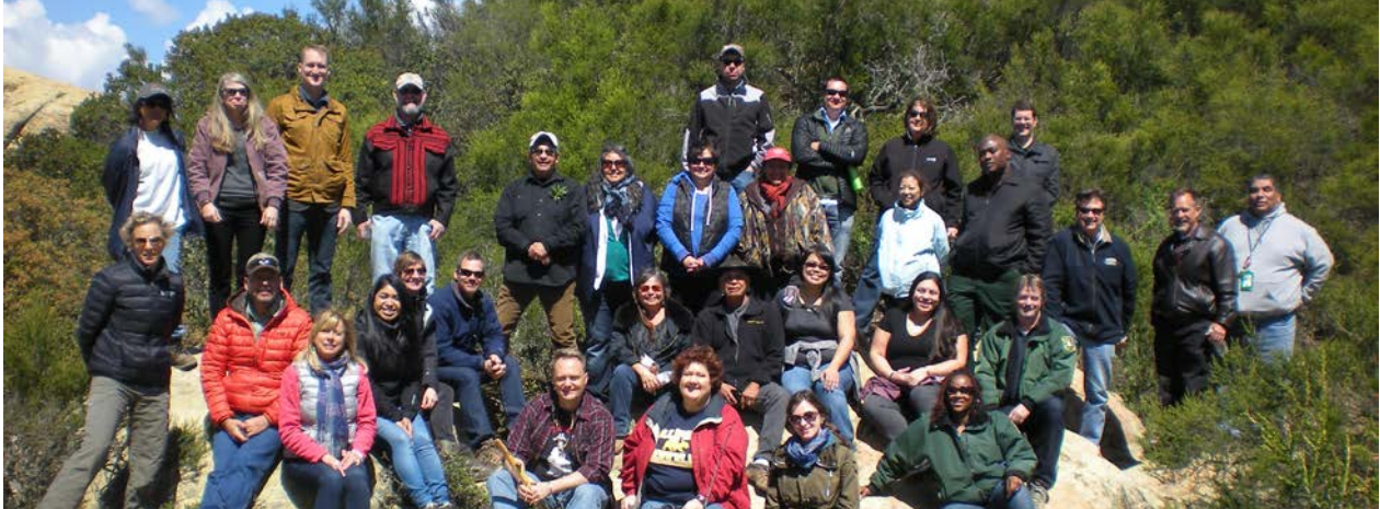
Workshop participants during the field trip to a Chumash sacred site on the Los Padres National Forest in California in 2016.

Tribal relations in the U.S. Department of Agriculture (USDA), Forest Service crosscuts all Forest Service deputy and mission areas. Every day, and in many ways, what we do in service to the Forest Service mission touches the peoples of American Indian and Alaska Native Tribal nations (Tribes) and the resources, natural and cultural, which are important to them. It is the responsibility of every Forest Service employee to deliver the Forest Service's trust responsibilities to Tribes. We strive to be good neighbors, and we provide excellent customer service.