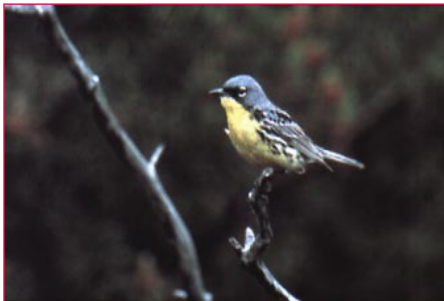
The Kirtland's warbler (above) is an endangered species that nests only in young jack pine forest (shown naturally regenerating below).

When Europeans applied these practices to parts of North America where fuel and climate conditions were different from those in Europe, catastrophic wildland fires resulted. In the Lake States, for example, loggers had clearcut the region's vast pineries by the 1870's. Farmers who settled the area—many of them schooled in Scandinavia's complex burning traditions (Pyne 1997)—routinely