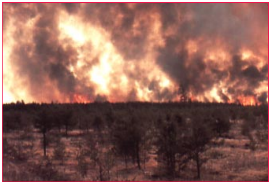
In 1980, a prescribed fire to promote Kirtland's warbler nesting habitat in young jack pine forest escaped to become the largest fire ever recorded on Michigan's Huron-Manistee National Forest. Known as the Mack Lake Fire, it burned 24,000 acres (9,700 ha), took 1 life, and destroyed 44 homes and buildings, highlighting the importance of safety and careful planning in prescribed fire use.

occupied many sites and reducing nesting habitat for the Kirtland's warbler. Recognizing this, in 1964 the Forest Service began logging and burning jack pine sites in an effort to perpetuate stands of young-growth jack pine suitable for Kirtland's warbler nesting (Line 1964; USDA Forest Service 1995b). The Michigan Department of Natural Resources followed suit in the early 1970's, and programs to control the cowbird emerged (Wilson 1989; USDA Forest Service 1995c). Federal and State protection measures helped reverse the warbler's decline by the late 1980's (Radtke et al. 1989). However, some prescribed fires on Federal land escaped, turning into major conflagrations that burned tens of thousands of acres and showed the risks inherent in using fire to manage wildlife habitat (Pyne 1982).