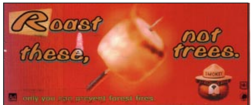
Figure 2—This billboard uses humor to communicate Smokey’s fire prevention message to adults.

To this day, Smokey Bear is recognized by millions of people the world over. Among fictional characters, Smokey enjoys a level of public recognition second only to that of Santa Claus. Although Smokey’s message is well known worldwide, wildland fires still plague the world. For our Nation to overcome the ongoing threat posed by human-caused wildland fire, the public needs to understand its role in preventing wildland fire and to make a concerted effort to avoid the careless use of fire in America’s wildlands. ■