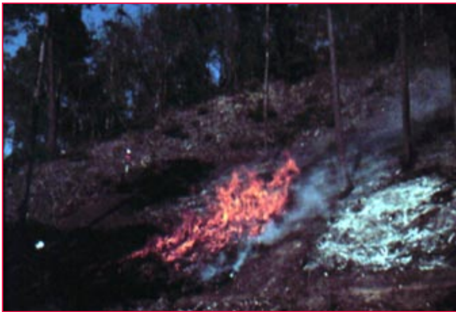
Figure 5 —Small experimental prescribed burn in Puebla, central Mexico. Photo: Dante Arturo Rodríguez-Trejo, Chapingo, Mexico, 1995.

found for Tobosa grass ( Hilaria mutica ) that forage production after fire is influenced by the quantity of annual precipitation. During years with good precipitation, forage production was 1.27 tons per acre (3.15 t/ha) in burned areas and 0.51 tons per acre (1.26 t/ha) in control areas. During dry years, forage production was 0.28 tons per acre (0.7 t/ha) in burned areas and 0.43 tons per acre (1.07 t/ha) in control areas.