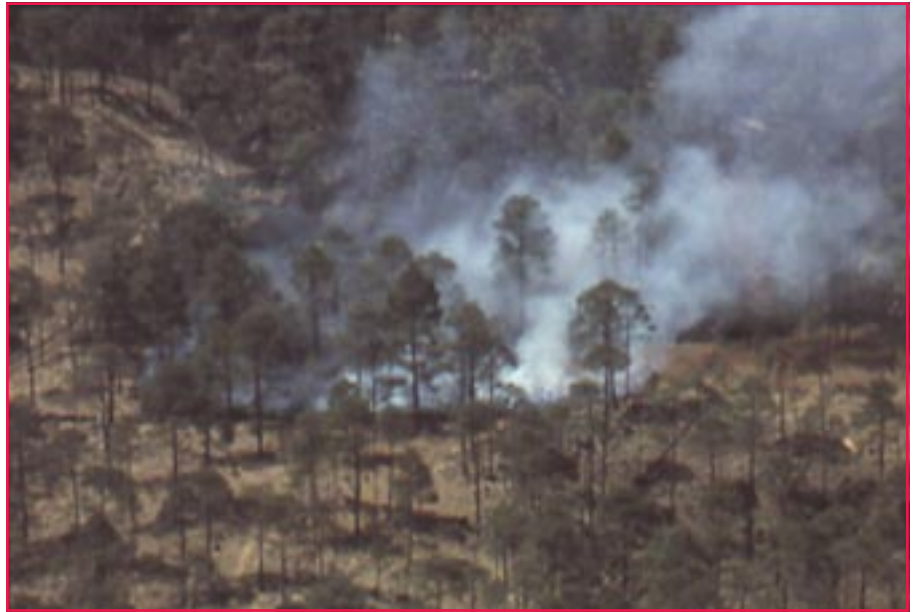
Figure 1 —A just-controlled surface fire in central Mexico in an open pine stand associated with grasses. Several types of Mexican pine forests are adapted to frequent low-intensity fire.

The low-frequency stand-replacing fire regime corresponds to true fir ( Abies ) forests. Frequent high-intensity fires are common in Mexico's shrublands, especially in the northwest, where shrubland is particularly widespread and represents climax vegetation. In central Mexico, shrublands are less abundant, and some represent a successional stage replaced over time by pine forest unless frequent disturbances occur. Shrub regeneration after fire is normally rapid; species of manzanita ( Arctostaphylos ) and oak ( Quercus ) quickly resprout after fire. For example, 3 months after a fire in central Mexico's shrublands, dwarf oak ( Quercus frutex ) typically has 607,050 rhizome resprouts per acre (1.5 million per ha) (fig. 2).