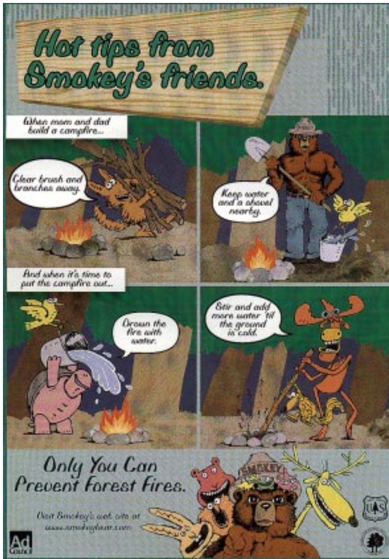
Figure 1—Public service announcements like this are part of the recent “Otter” series aimed at children.

Thanks to the Forest Fire Prevention campaign, the number of wildland fires caused by children has dropped dramatically since 1984.