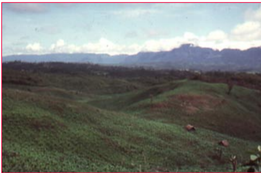
Figure 3 —An open landscape in Chiapas, southern Mexico, created by slash-and-burn cultivation. This fire practice is thousands of years old, dating at least to ancient Mayan civilization.