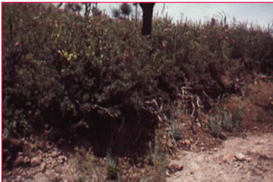
Figure 2 —Abundant dwarf oak ( Quercus frutex ) rhizome sprouts 3 months after a stand-replacing fire in the State of Mexico (central Mexico). Photo: Dante Arturo Rodríguez-Trejo, Chapingo, Mexico, 1992.

Nine of the past 13 years have seen the highest numbers of wildland fires in modern Mexican history; and 6 of the past 13 years have seen the highest numbers of acres burned.