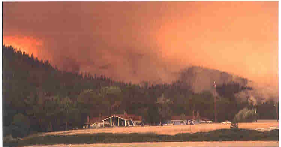
Figure 1 –FS protecting a WUI home from wildfire.

The protection of homes and other property in the WUI is an escalating fire problem. WUI development has been steadily increasing with housing starts in the WUI being three times greater than elsewhere. In the fire-prone areas of the western Rocky Mountains, 2.2 million homes are expected to exist in the WUI by the year 2030—a 40 percent increase over current levels. Independent research by the National Academy of Public Administration has found that the majority of landowners moving in take no actions to reduce their home's vulnerability to wildfire and that many local governments do not require homeowners to implement wildfire mitigation activities or regulate growth in these areas. 12