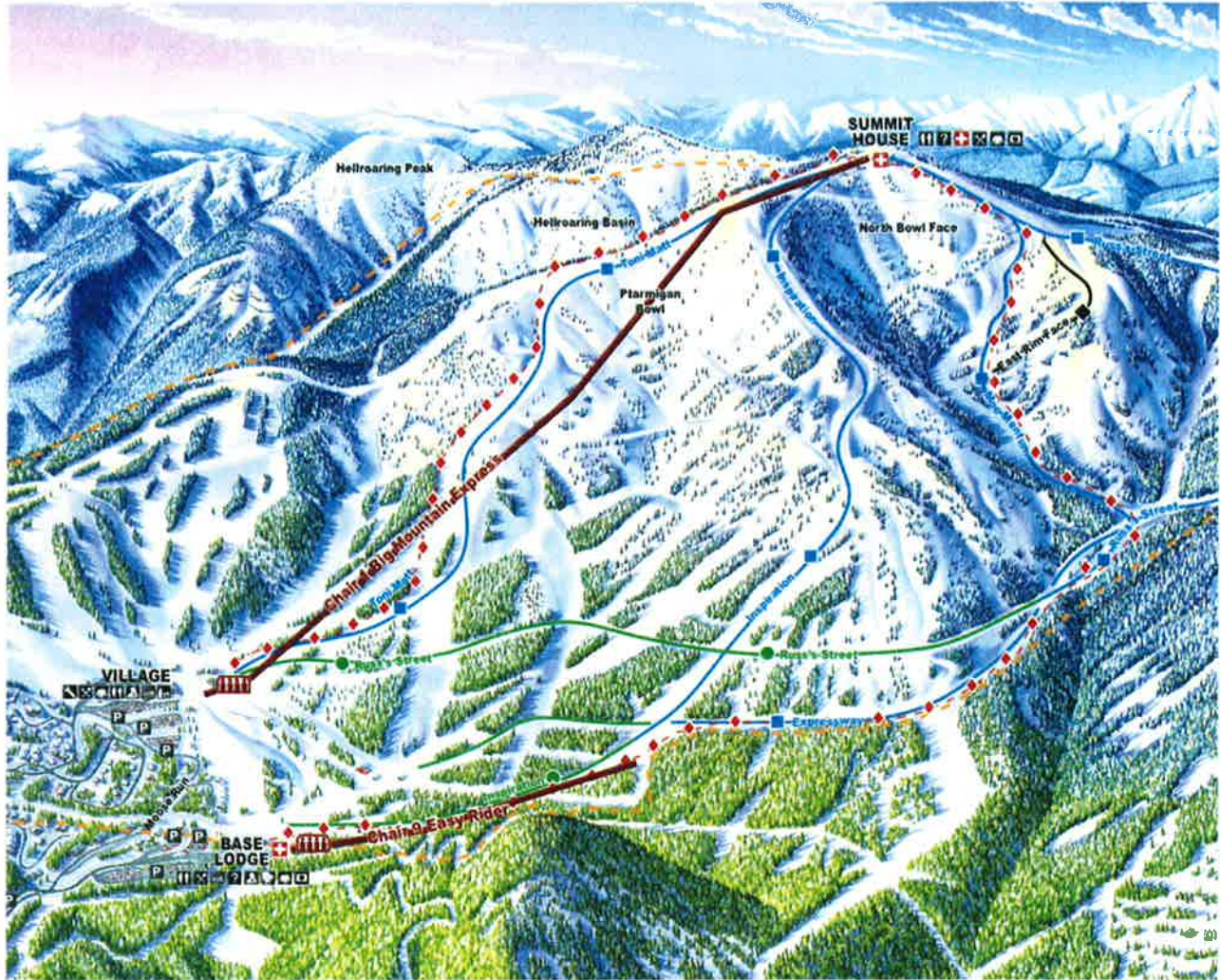
Whitefish Mountain Resort Uphill Map: