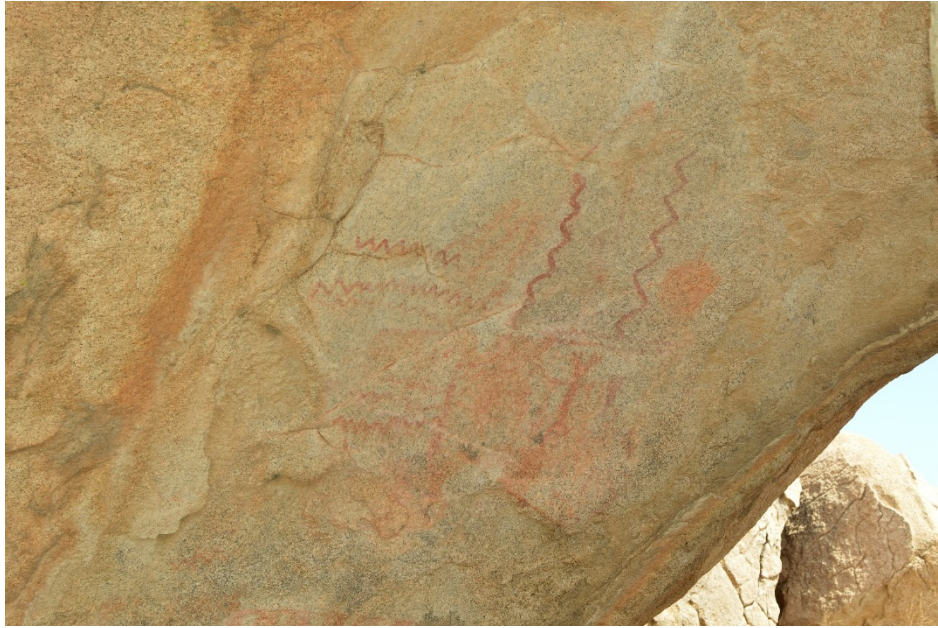
Ancestral Native American pictographs appear on the western side of the Dragoon Mountains.

shares his knowledge of the lithic technology developed by Native cultures, demonstrating flint knapping techniques used to make stone tools—for example, chipping rocks to make arrowheads. "By watching how stone tools are made, our staff can see stone tool debris. That debris is the main component of how we identify stone tool productions," he said.