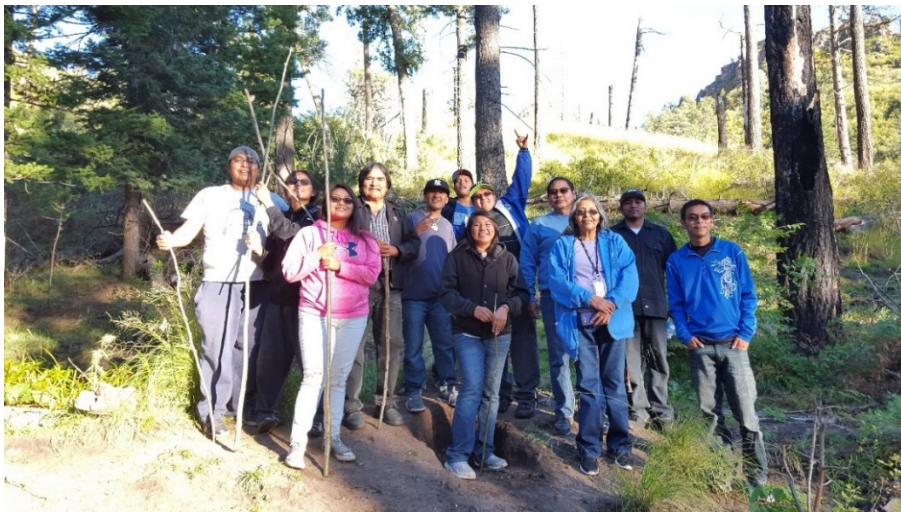
Staff from the Hopi Workforce Innovation and Opportunity Act program, members of the Hopi Cultural Resource Advisory Task Team and Hopi youth enjoyed the day hiking to visit Pieper Spring.

The Hopi consider natural springs to be traditional cultural properties. 'Water is Life,' for the Hopi people, who live in an arid environment and have much knowledge to share about water protection and preservation.