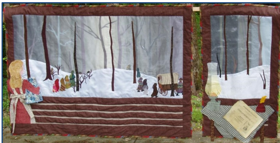
Quilts made by volunteers of the Shawnee National Forest depict harsh conditions on the Trail of Tears.