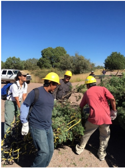
Tribal youth and Forest Service staff remove brush from the Shoofly Archaeological Site.

The Hopi Tribe considers archaeological artifacts and features to be the footprints of their ancestors. Material evidence of human occupation serve to remind the Hopi people of the existence and migration path of ancestors. Hopi elders pilgrimage far and wide each year to places like Shoofly Ruin to place spiritual offerings. Shoofly Archaeological Ruin has specific management protocols that call for the hand-cutting and hand-removal of trees and brush in order to prevent unnecessary damage to archaeological features. Youth assisted Forest Service staff in cutting and carrying tree and brush limbs for removal.