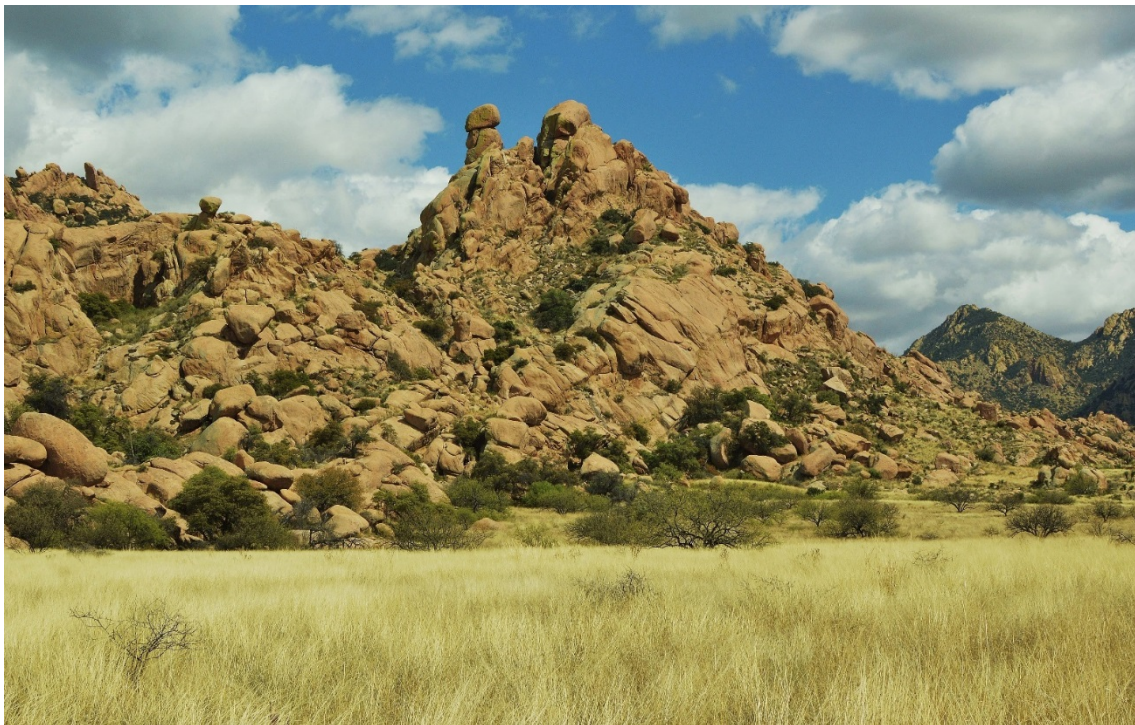
The western side of the Dragoon Mountains lies in a rain shadow with drier vegetation than the East Stronghold. Council Rocks are among its massive granite boulders.

Home to the Apache also includes the western side of the Dragoons with its enormous granite boulders of Council Rocks. In 1872, General Oliver Otis Howard met Cochise at the slopes of Council Rocks and agreed to a peace treaty that would set aside a reservation for the Chiricahua. Faded pictographs and ancient mortars dot the large rocks.