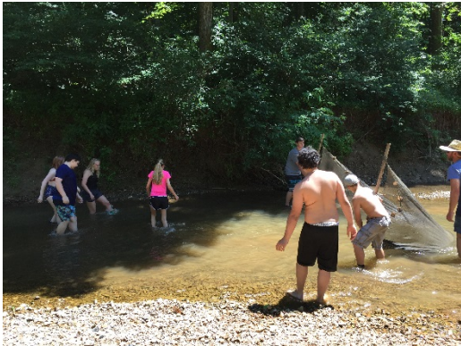
Campers learning about native fish and their habitat with a fish seine in Big Creek, in the very southeastern part of Illinois.

This summer the Shawnee National Forest hosted youth from federally-recognized Tribes for the third consecutive year. Twelve youth from two Tribes—the Eastern Shawnee Tribe of Oklahoma and the Shawnee Tribe—explored the Shawnee National Forest and learned about the ecology and history of the Eastern Woodlands through the week-long More Kids in the Woods program. This program was supported by a grant from the Eastern Region and through partnerships with the Southern Illinois University Center for Archaeological Investigations and Touch of Nature Environmental Center. Among their many activities, youth assisted with an archaeological investigation along the Trail of Tears National Historic Trail and canoed and snorkeled on the Cache River, once utilized by their Shawnee ancestors.