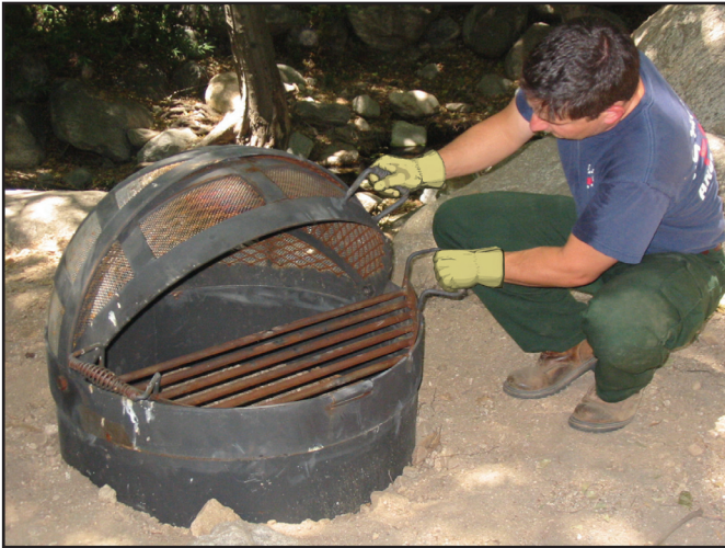
Figure 2—EmberGuard with campfire ring installed.

If using an existing campfire ring, the bolt length will depend on the campfire ring's diameter. The EmberGuard is somewhat awkward to install due to its spherical shape and weight. Wear gloves to protect your fingers from being pinched when moving the EmberGuard. An optional lifting kit is available from the company at additional cost. During SDTDC's evaluation, four people did the first installation, which was faster and easier than the two-person crew that installed the campfire ring and second EmberGuard (figure 2).