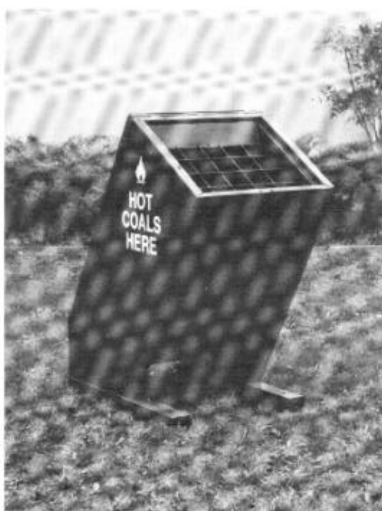
Figure 4. Hot Coals Container.