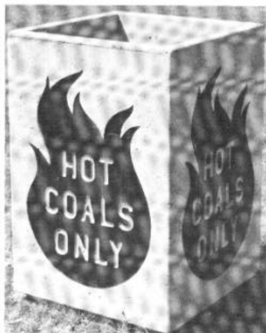
Figure 1 Concrete Hot Coals Receptacle by Precast Concrete Inc.

The receptacle has a sandblasted finish and comes in two standard colors, natural gray and tan. Other colors can be special ordered to suit customer needs. A large graphic image of a flame on all four sides reduces any confusion about the receptacle's intended use. The unit measures 28-in x 28-in x 42-in high (0.7 m x 0.7 m x 1.07 m) and weighs approximately 1400 lb. (635 kg). The container, designed with a steel grate 6 inches (150 mm) below the top of the unit, keeps small children from reaching inside. The receptacle should be filled with approximately 10 inches (254 mm) of sand—1/4 the depth of the unit—to act as a filter and to facilitate drainage. The sand also keeps the coal dust from draining away after a rain. The unit has a hole in the center of the bottom for drainage. Remove the steel grate prior to emptying the ash. Then, use a long handled flat shovel to remove the ash deposited above the level of the sand.