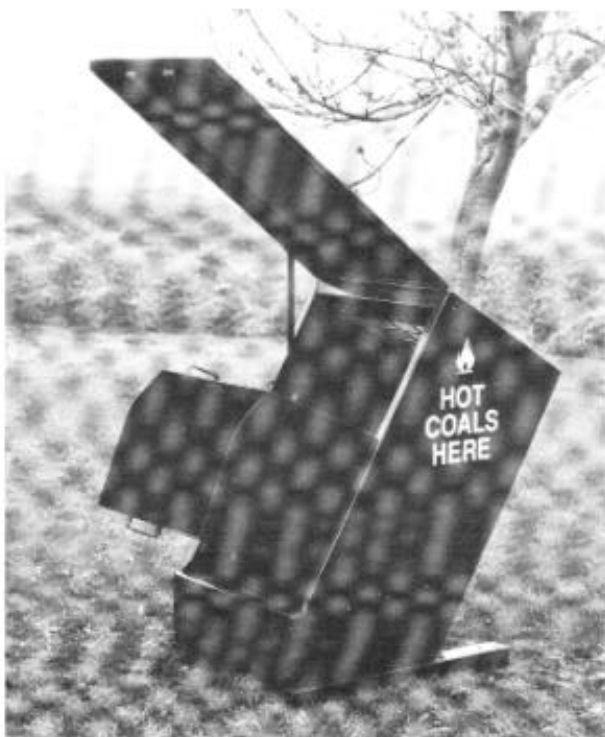
Figure 3. Hot Coals Container by McClintock Metal Fabricators, Inc.

McClintock Metal Fabricators in Woodland, California has recently manufactured a metal hot coals container (figures 3 and 4). The container, manufactured with riveted 12 gauge galvanealed steel, is finished with a red coat of polyurethane paint over a coat of primer. The hot coals basket is painted black. The unit is approximately 26-in x 42-in x 48-in (0.6 m x 1.1 m x 1.2 m) and can hold up to 6 cubic feet (0.17 m 3 ) of coals. The unit is easy to empty; the rear of the container swings open to allow for maintenance access. The container can be bolted to a hard, level concrete (or similar) surface. The cost of the unit is approximately $780.00 and is available through GSA. Volume discounts are available. Shipping is extra. Cost depends on the customer's location and quantity ordered. Delivery is available anywhere in the U.S.