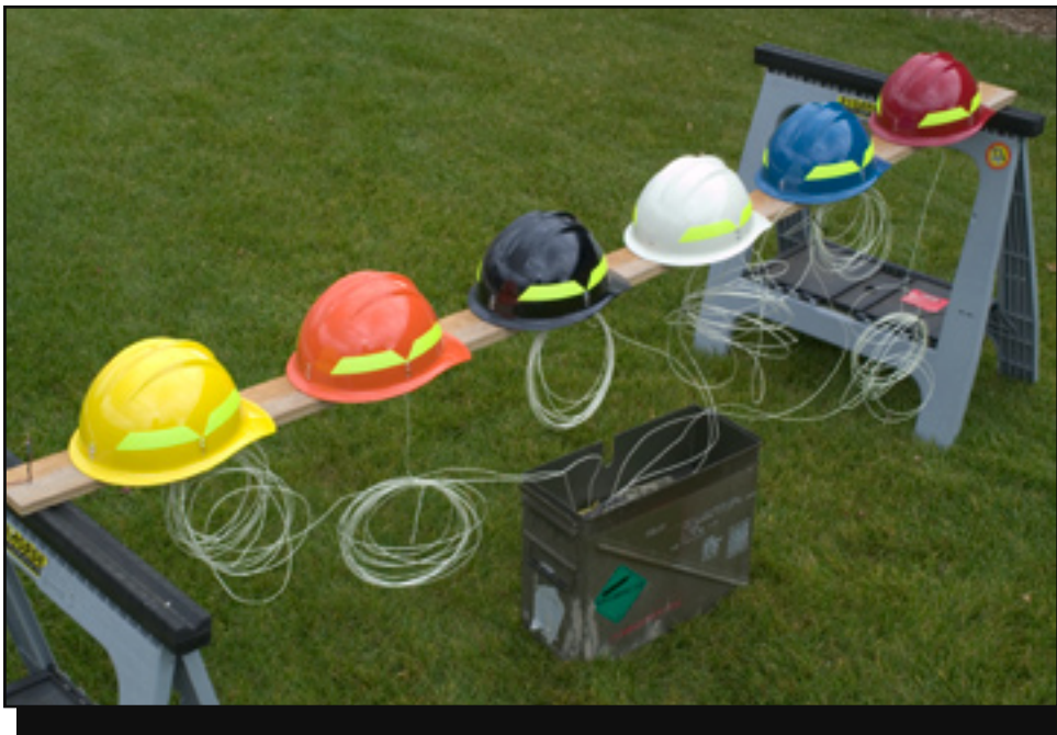
Figure 1—The six hardhats on the test rack were wired to a datalogger that recorded the temperature inside the hardhat every 5 minutes.

The thermocouples were in the center of each hardhat, 4 inches from the bottom rim, at about the same depth as the top of a wearer's head. Data were collected at 5-minute increments, over a 6- to 7-hour period, for three consecutive days.