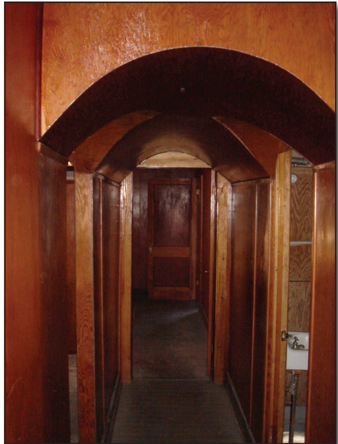
Figure 1—Varnished plywood covers the walls and ceiling of the Rabideau infirmary, which was built in 1935.

As noted in the tech tip, Early 20th-Century Building Materials: Introduction ( http://www.fs.fed.us/t-d/pubs/htmlpubs/htm06732314/ Username: t-d Password: t-d), the Forest Service always has encouraged the use of wood-based products in its facilities. As early as 1933, acceptable wall and ceiling products included fiberboard (sometimes