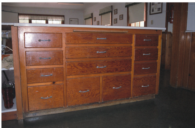
Figure 8—These plywood cabinets, constructed by the CCC in the cookhouse at the Fenn Ranger Station, are on the kitchen side of the serving counter. In this structure, cabinets visible only to the cook are plywood, while cabinets visible from the dining room are constructed of solid lumber.

Originally limited to door panels, walls, and ceilings (figure 7), plywood eventually was accepted in other applications, such as sheathing and cabinetry (figure 8), and exterior finished surfaces.