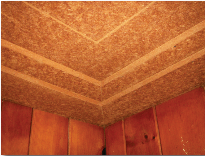
Figure 3—This fiberboard ceiling in the Butte Falls Ranger Station (Rogue River-Siskiyou National Forest, Pacific Northwest Region) has been carved into a decorative pattern. The ceiling is the natural brown color of the wood pulp from which it was manufactured.