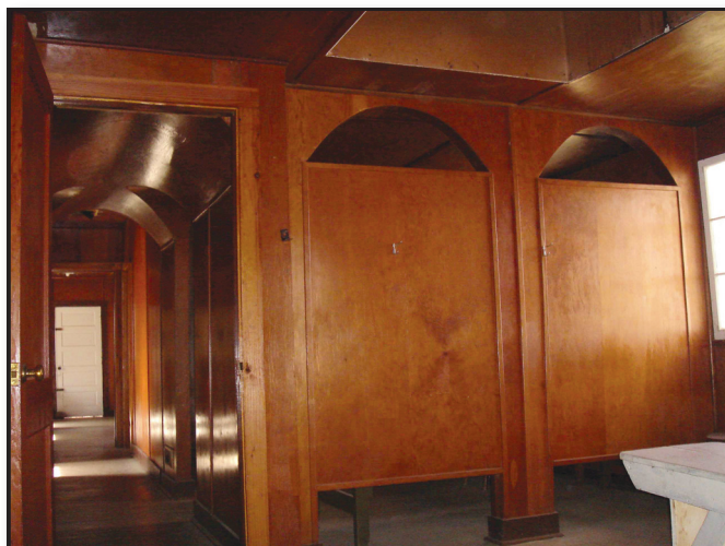
Figure 7—The interior of the infirmary at the Rabideau CCC camp (recently designated as a National Historic Landmark) is finished in varnished plywood, including curved vaults in the hallway and some rooms. Camp Rabideau is part of the Blackduck Ranger District (Chippewa National Forest, Eastern Region).

The first standard-size sheets of plywood were 3 by 6 feet, but by the early 1930s, 4- by 8-foot sheets were standard. They typically had an odd number of layers, although plywood with even numbers of layers has been produced since World War II. As the techniques for manufacturing plywood were perfected, manufacturers increasingly offered plywood with decorative veneers and finishes. Some were made with striations or V-shaped grooves carved into them. Others were embossed or prefinished in several colors.