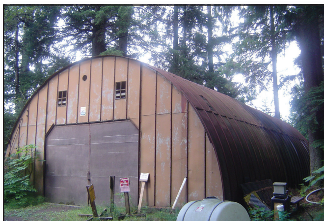
Figure 6—Masonite was often used to finish the interiors of the Quonset huts that the Forest Service acquired from the military after World War II. This Quonset hut is now used for storage at the Duck Creek Administrative Site (Juneau Ranger District, Tongass National Forest, Alaska Region).