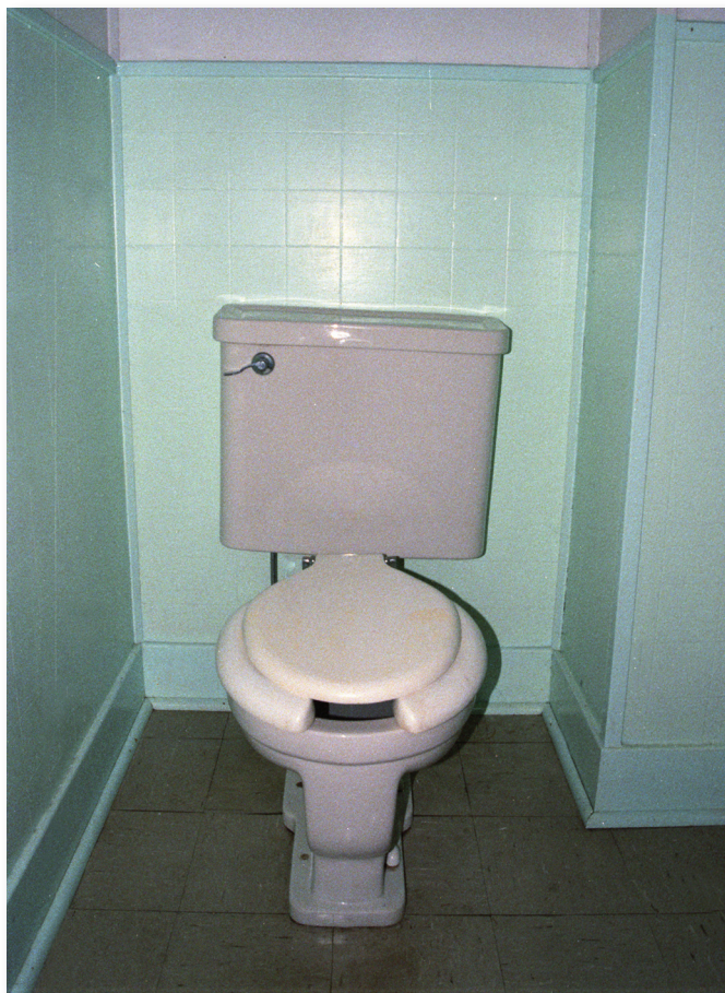
Figure 5—Temptrtile, a hardboard product embossed to resemble tile, was used as a water-resistant wainscot in the cook's bathroom at the Fenn Ranger Station.

Masonite and other hardboards became staples of premanufactured housing and lined the interiors of more than 150,000 Quonset huts during World War II (figure 6). By the 1950s, hardboard siding was available in panel, shi lap, shingle, and board-and-batten styles. Optional features included factory-applied primers, vented mounting strips, and several textures. Another 1950s Masonite product was a gray, wood-grained interior wall panel known as Misty Walnut. Masonite's Royalcote, with its polished and durable faux wood finish, also proved popular.