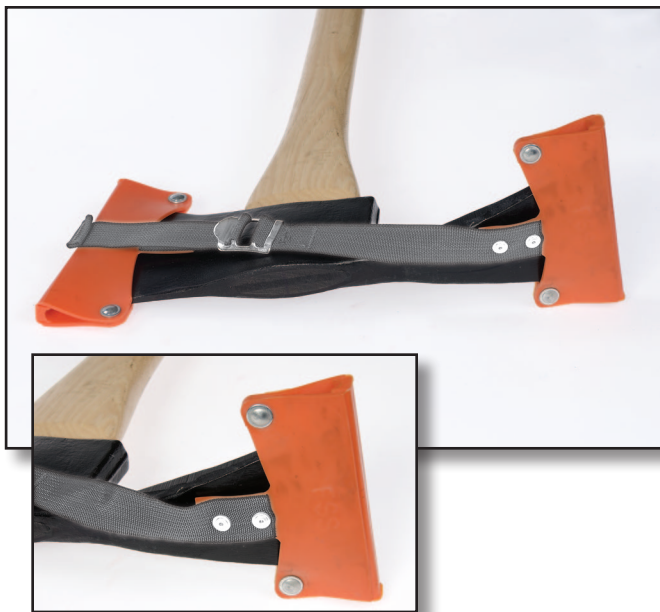
Figure 4—Rivet (inset) the 1-inch-wide webbing to the plastic strap.