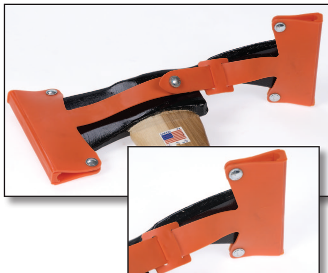
Figure 1—The existing Pulaski sheath has been used by trail maintenance and firefighting employees since the 1980s. The strap (inset) tends to slip through the buckle, allowing the toolhead covers to fall off.