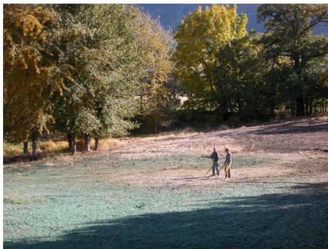
Hydro-seeding native seeds at Balfour Restoration site