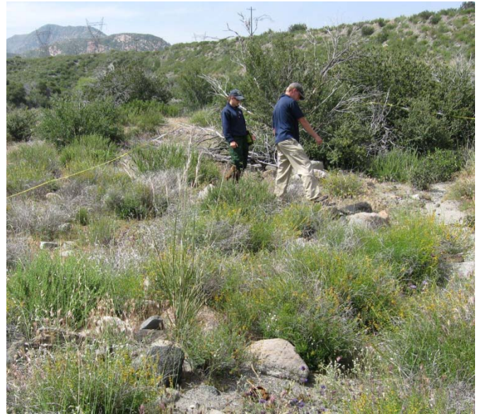
Figure 2. Disturbances along road and powerline corridors above sensitive habitat create a continuous need for seeds.

We have collated information on over 30 species and drafted detailed plant profiles for posting on the Riverside-Corona Resource Conservation District's newly designed web site ( http://www.RCRCRD.com ). The list of species is on the website under "Native Plants" and "Plant Materials" (Figure 1) and many profiles will be uploaded to the site. A link will be made available from the USFS "Celebrating Wildflowers" web page for the Pacific Southwest Region. The profiles contain information to help users determine collection protocols, seed deployment strategies, to assist native plant material developers produce genetically appropriate seeds (e.g., Figure 2).