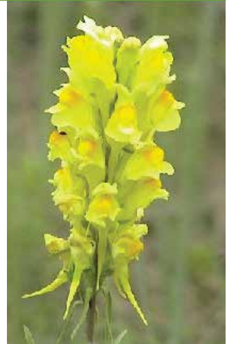
Yellow Toadflax

The following table ( Hummingbird Nectar Plants for Ecoregions in the Eastern U.S. ) lists some plants that are nectar sources for hummingbirds. These plants are native to The Eastern U.S., and are adapted to conditions in the ecoregions indicated in the table. The table also provides basic information on habitat and light, soil, and water needs. Finally, the tables provide seed sources for each plant valid as of November 2016. A directory of the seed sources follows the tables. Use locally-adapted genetically appropriate plants in all your restoration and pollinator enhancement work. Seed zones—areas with genetically similar plants—help determine the right plant materials to use; poorly chosen plants usually fail to thrive. See http://fs.bioe.orst.edu/web_maps/Seed_Zones.html for provisional seed zones of the Eastern U.S., and select plant materials from your zone. Planting non-natives to attract hummingbirds is against policy and destructive: these plants can become invasive and disrupt ecosystems. For example, yellow toadflax ( Linaria vulgaris , also called “butter and eggs”) is attractive to hummingbirds but is a noxious weed.