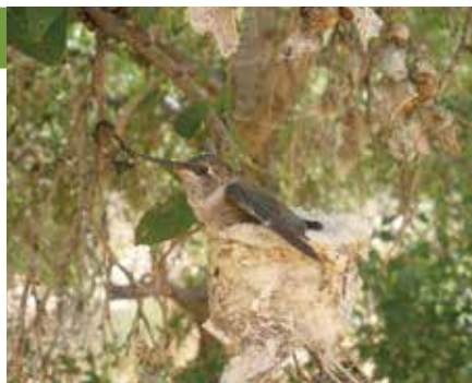
Black-chinned hummingbird nesting

Hummingbirds play an important role in the food web, pollinating a variety of flowering plants, some of which are specifically adapted to pollination by hummingbirds. Some hummingbirds are at risk, like other pollinators, due to habitat loss, changes in the distribution and abundance of nectar plants (which are affected by climate change), the spread of invasive plants, and pesticide use. This guide is intended to help you provide and improve habitat for hummingbirds, as well as other pollinators, in the Eastern U.S. While hummingbirds, like all birds, have the basic habitat needs of food, water, shelter, and space, this guide is focused on providing food—the plants that provide nectar for hummingbirds. Because climate, geology, and vegetation vary widely in different areas, specific recommendations are presented for each ecoregion in the Eastern U.S. (See the Ecoregions in the Eastern U.S. section, below.)