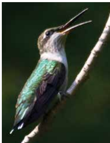
Ruby-throated Hummingbird—female

red gorget gives the species its name. Adult males also have iridescent green backs, dark flanks, and forked tails with pointed dark feathers. Females of any age are green-backed and all white beneath, including the throat; tips of the outer three tail feathers are rounded and white. Immature (first year) males resemble females—including the tail; their throats may be all white, streaked in green or black, and/or with one or more red feathers. Although adult males in some other western North American species have metallic red gorgets (e.g., Broad-tailed Hummingbirds), they should not be called or confused with “ruby-throats.”