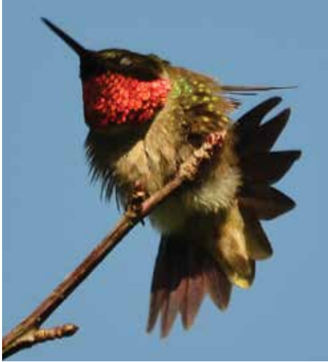
Ruby-throated Hummingbird—male

RANGE —Ruby-throated Hummingbirds are the only hummingbirds that breed in eastern North America, including southern Canada from Newfoundland to just west of the Alberta–British Columbia border. They occur regularly in 38 eastern states but only rarely as vagrants in the western U.S. By mid-October nearly all ruby-throats migrate to central Mexico or Central America as far south as western Panama, returning to Gulf Coast states as early as February before dispersing northward. Migration routes are not well-understood; some ruby-throats have been observed in trans-Gulf