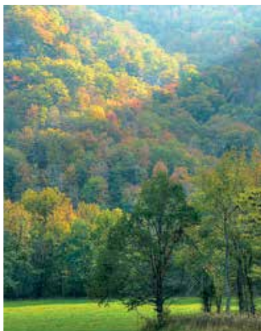
Fall in the Ozarks, Northwest Arkansas

Whether you're involved in managing public or private lands, large acreages or small areas, you can make them attractive to our native hummingbirds. Even long, narrow pieces of habitat, like utility corridors, field edges, and roadsides, can provide important connections among larger habitat areas.