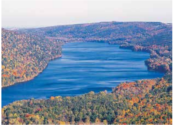
Candace Lake in the Finger Lakes, New York.

Hummingbirds get adequate water from the nectar and insects they consume. However, they are attracted to running water, such as a fountain, sprinkler, birdbath with a mister, or waterfall. In addition, insect populations are typically higher near ponds, streams, and wetland areas, so those areas are important food sources for hummingbirds.