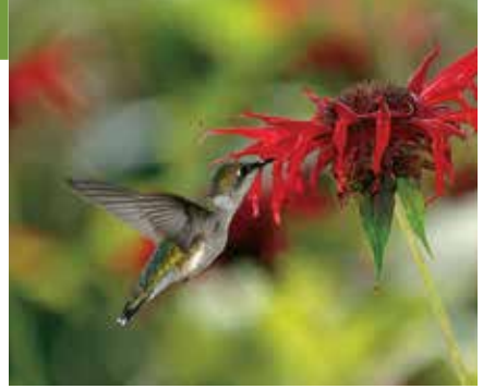
Ruby-throated hummingbird drinking nectar from scarlet beebalm - Monarda didyma

Hummingbirds feed by day on nectar from flowers, including annuals, perennials, trees, shrubs, and vines. Native nectar plants are listed in the table near the end of this guide. They feed while hovering or, if possible, while perched. They also eat insects, such as fruit-flies and gnats, and will consume tree sap, when it is available. They obtain tree sap from sap wells drilled in trees by sapsuckers and other hole-drilling birds and insects.