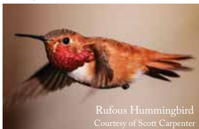
Rufous Hummingbird