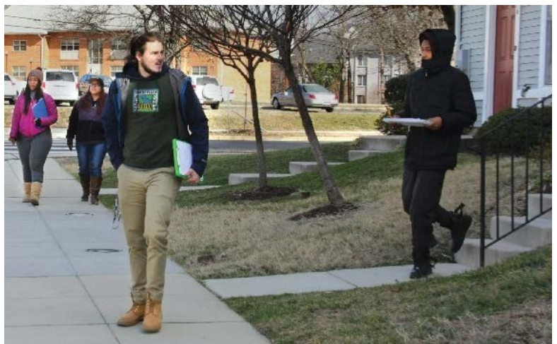
Earth Conservation Corps members canvass the Congress Heights neighborhood of Southeast DC, a high-priority area for American Forests' Community ReLeaf outreach and tree planting initiatives.

As the primary implementer of on-the-ground activities, the Earth Conservation Corps employed a variety of community engagement methods, including branding, door-to-door engagement, community meetings, public service announcements ,