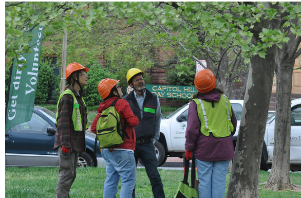
Pruning Corps.