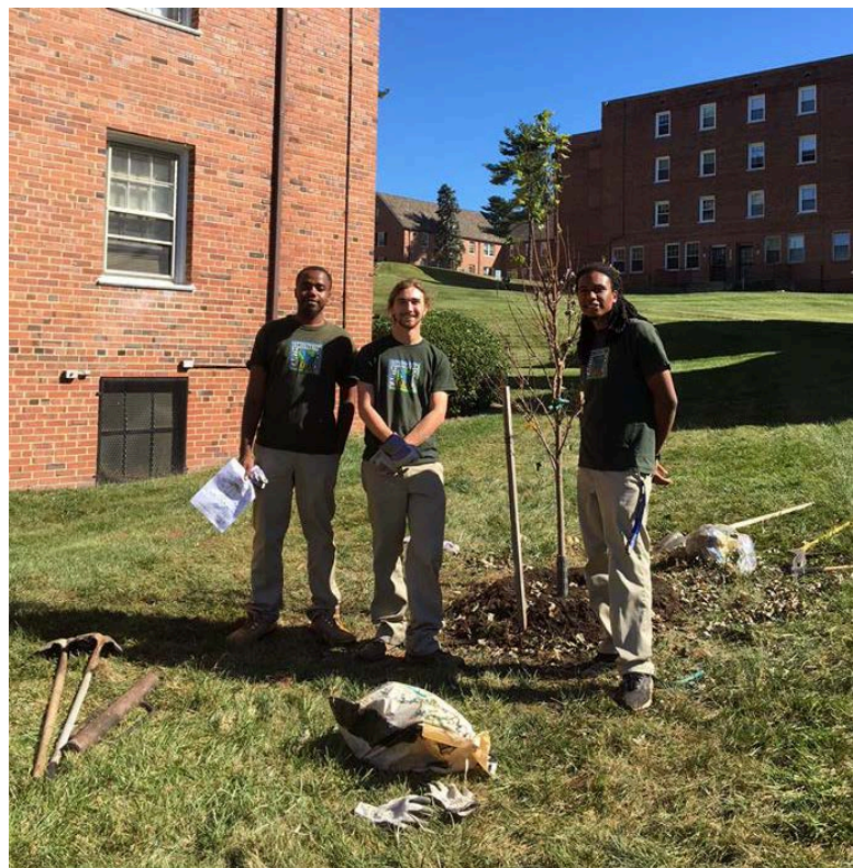
Earth Conservation Corps planting on DC Housing Authority property.